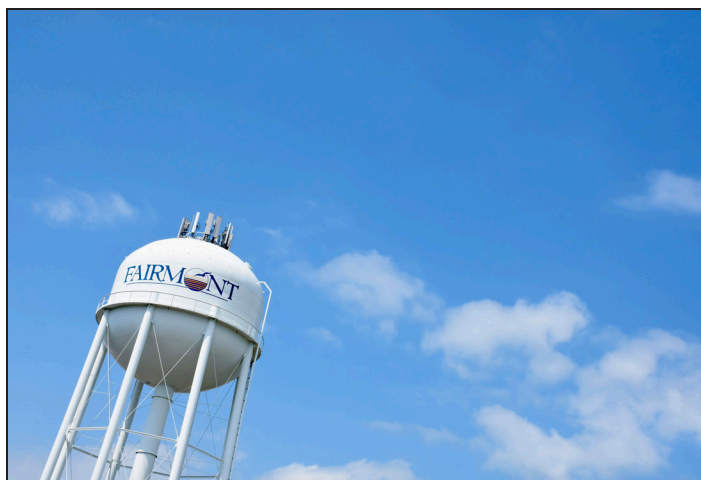
The city of Fairmont supplies about 3,900 residential users with drinking water.

With a $260,000 Clean Water Fund grant awarded in 2025, the Martin SWCD will offer incentives for practices including up to 55 acres of new enrollments in the federal Conservation Reserve Program (CRP) and 700 acres of split-rate nitrogen application; and cost-share for seven high-