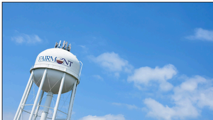
The city of Fairmont supplies about 3,900 residential users with drinking water.

That field contains a draw that stretches back a half mile, draining about 55 acres. Existing grassed waterways couldn’t handle