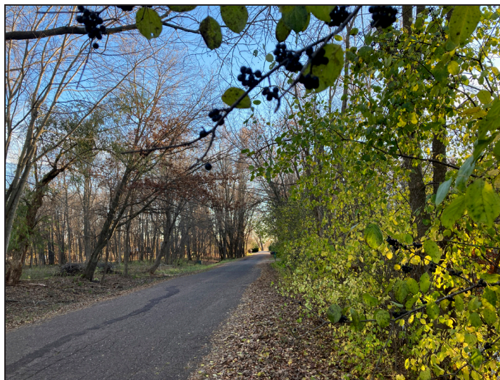
A road divides the cleared site and a buckthorn-infested woods.