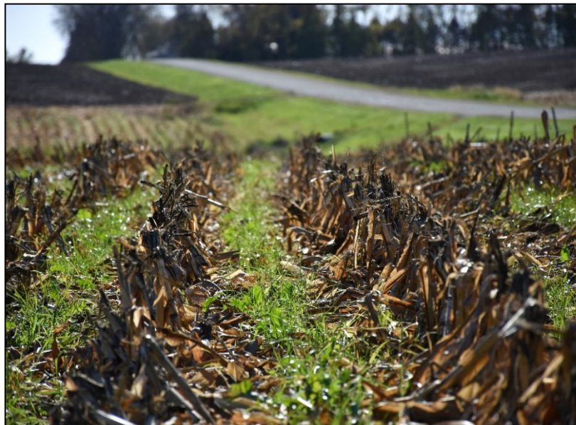
Cover crops grow between rows of harvested corn on a Goodhue County farm.

Participating counties include (East) Otter Tail, Fillmore, Houston, Kandiyohi, Redwood, Renville, Stevens and Wadena. SWCDs in these counties are receiving grant funding from the Minnesota Board of Water and Soil Resources (BWSR) to assist local landowners with navigating the process of adapting their operations for climate-smart practices.