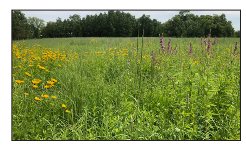
The 61-acre easement on Star Lake includes a natural shoreline. Wild rice flourishes in the shallow bay. The easement includes pockets of aspen, 32 acres of mixed hardwoods, 14 acres of wetlands and 11 acres of upland grasses.