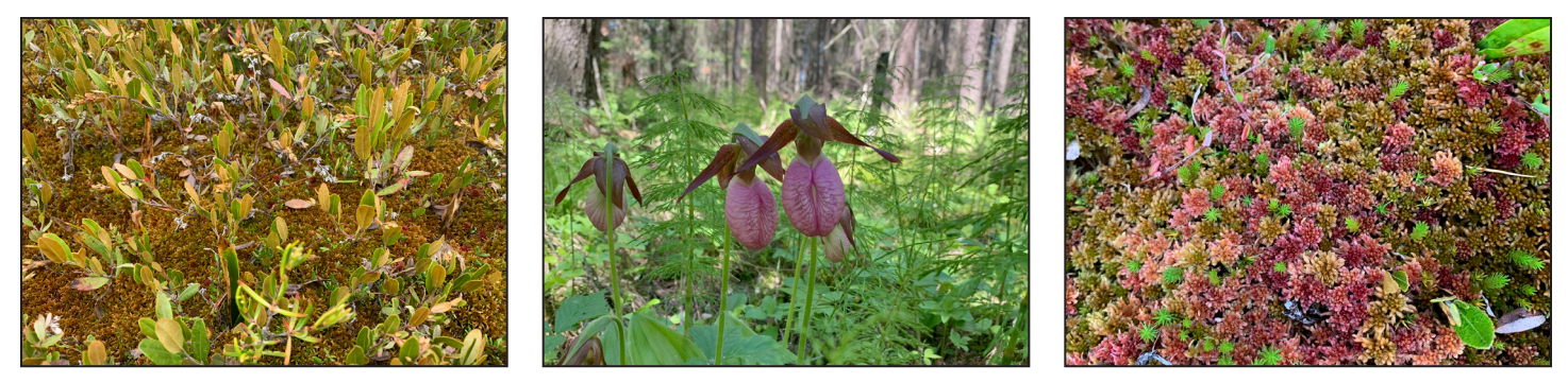
Mosses and plants, including an orchid, center, grow in and near the Sax-Zim Bog near Hibbing.

strategy for reducing greenhouse gas emissions.