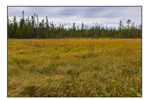
conditions that trap most greenhouse gases, except for some methane emissions.

The 24,000-acre Sax-Zim Bog southeast of Hibbing was protected and restored as part of the Lake Superior Wetland Bank. Peatlands (bogs and fens) hold some of Minnesota's largest carbon reserves, but emit large quantities of carbon when ditched and drained. Protecting existing peatlands and other wetlands, and restorina drained, farmed or pastured peatlands and wetlands will increase carbon storage.