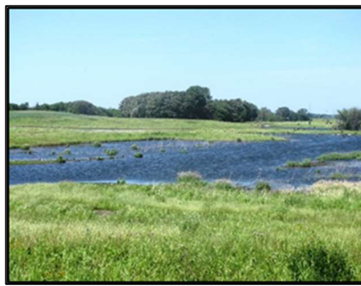
Wetland Restoration ( Std. 657 ) or Impoundment