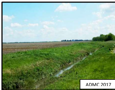
Saturated Buffer ( Std. 604 )