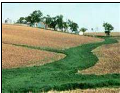
Grassed Waterway ( Std. 412 )