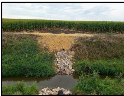
Side Inlet to a Ditch ( NRCS FOTG Std. 410 )