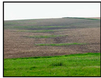
Water & Sediment Control Basin ( Std. 638 )