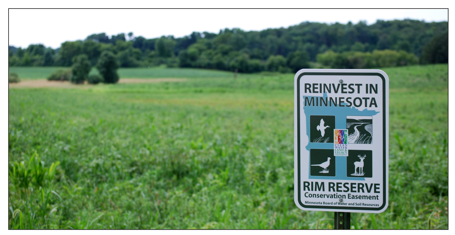
A Minnesota Conservation Reserve Enhancement Program (MN CREP) easement recorded in 2018 on Loreli and Rob Westby's west Ottertail County farm protects 620 acres. Land enrolled in MN CREP is also enrolled in a permanent Reivest in Minnesota (RIM) Reserve easement and a federal Conservation Reserve Program easement. This easement protects native vegetation established on former cropland, plus a restored weltand. A new BWSR program seeks to extend RIM easements to riparian and floodplain areas.

"The option to generate income on the easements via working lands activities might be appealing to some," said BWSR Easement Programs Coordinator Dusty VanThuyne. "I think the options available under this program are more likely to fit what landowners are looking to do to meet their goals for their properties."