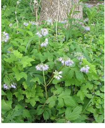
Virginia Waterleaf growing in rich woods

With attractive flowers and unique leaf patterns, Virginia Waterleaf is a stunning component of the woodland understory. This early blooming species grows 12-20" tall in partial to dense shade in moist woods and floodplain forests. Its elegant flowers provide important early season sources of pollen and nectar for pollinators. The plant's ability to tolerate disturbance, establish quickly and thrive along within a diversity of other woodland flowers makes it well suited for restoring woodland understory cover.