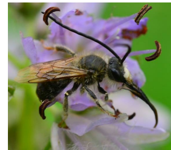
Andrena bee on waterleaf

At least two specialist pollinators use Virginia waterleaf, the waterleaf cuckoo bee ( Nomanda hydrophylli ) and Andrena bees ( Andrena geranii ). Flower nectar and pollen attract many other types of bees including bumblebees, long-horned bees ( Synhalonia spp. ), mason bees ( Osmia spp. ), Halictid bees ( Lasioglossum spp. , Augochlorella spp. , etc.), Andrenid bees ( Andrena spp. ), and bee flies (Bombyliidae). The foliage is occasionally browsed by White-tailed deer, but does not seem to be a preferred food. The species can be used to establish cover on bare areas, such as woodland openings after buckthorn removal. It may not be ideal for some small woodland gardens due to its ability to spread.