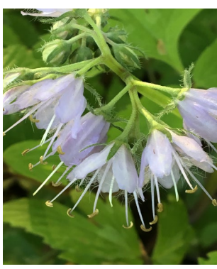
Clusters of tubular flowers