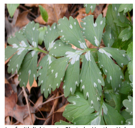
Leaf with light spots.

Pale violet, pinkish or white flowers are born in loose clusters from May to June. The tubular flowers are about ½ inch long, and have long stamens. Leaves are deeply divided into 3, 5 or 7 lobes with coarse teeth. Mature leaves are six inches long and four inches wide and may be slightly hairy. The leaves commonly have a water stained appearance that can fade with age. The main stem is purplish where the leaves attach and may have flattened hairs on the stem. Hydrophyllum was formerly placed in the Hydrophyllaceae (Waterleaf) family but is now considered part of the Boraginaceae (Borage) family.