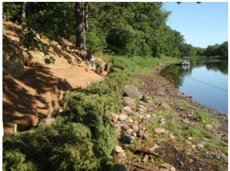
Bank stabilization with cedar revetments and erosion fabric along the St. Croix River