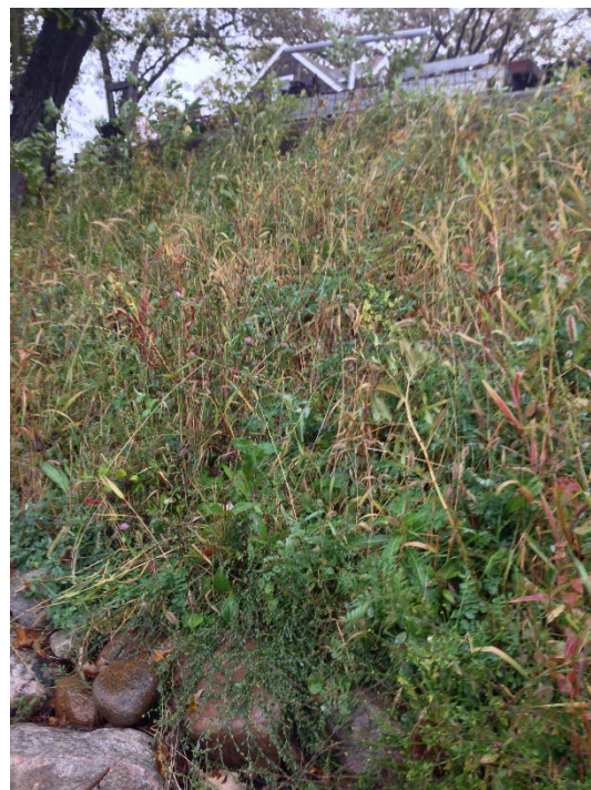
Steep bank stabilized with flowers, grasses and erosion fabric

Vegetation Establishment – A variety of methods may be used to plant steep slopes along streambanks, including hydroseeding, broadcast seeding, tree plantings, and promoting natural succession. Upland portions of restored slopes are typically broadcast or hydroseeded, as they are often too steep for seed drills. Seed to soil contact is very important for successful establishment, so the use of rollers or erosion control fabric to cover seed will aid establishment. Very steep eroding banks can be very difficult to stabilize. In some cases, slopes can be regraded to decrease steepness. If regrading is not possible, willow cuttings can sometimes be inserted from the base of the slope. Hydroseeding, where seed and water are simultaneously blown onto slopes followed by a tackifier to improve seed to soil contact, may also be an option. Plants that can