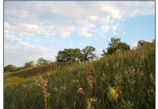
Remnant prairie in Goodhue County

Intact native plant communities such as remnant prairies, savanna and calcareous fens are now uncommon in the Minnesota landscape and those that remain are losing plant diversity from fragmentation, invasive species, and negative impacts from surrounding land uses. These plant communities should be buffered with conservation plantings and connected to habitat corridors and larger habitat complexes when possible to avoid abrupt transitions between plant communities and to promote plant and animal dispersal.