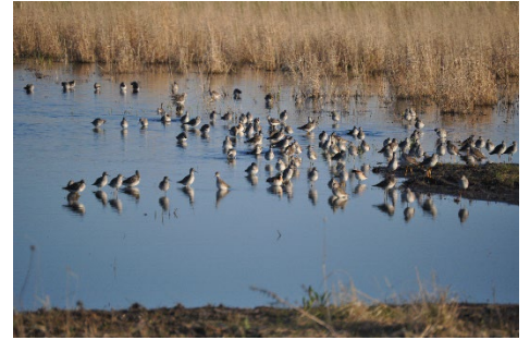
Shorebirds using a restored wetland