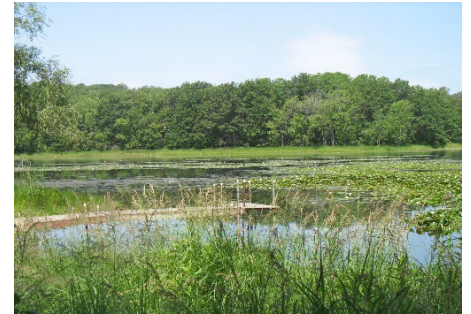
Vegetation providing water quality and wildlife habitat benefits