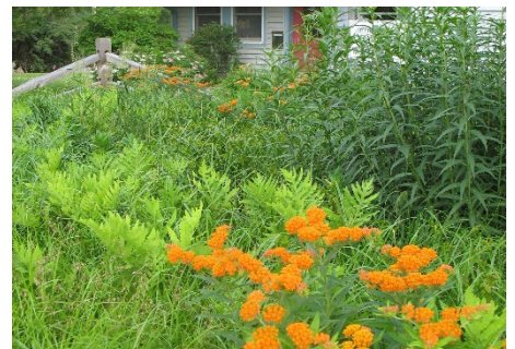
Raingarden designed to infiltrate and filter stormwater