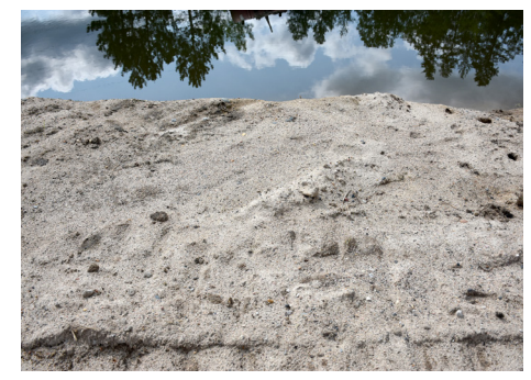
Left: Because the ditch flowing into the constructed wetland intersected with groundwater, water was pumped to the surface during construction, and then allowed to infiltrate back through the sand. As a precaution, a skimmer cleaned water before it discharged to the lake. Middle: From left: Gutknecht observed progress at the site Sept. 9 with Tracy and Severts. Right: Clouds and trees reflect in water at the site.

Shawn Tracy, a lead scientist with HR Green, worked with Bemidji on its stormwater retrofit analysis that led to a Lake Irving feasibility study. He was in Bemidji in early September to monitor construction.