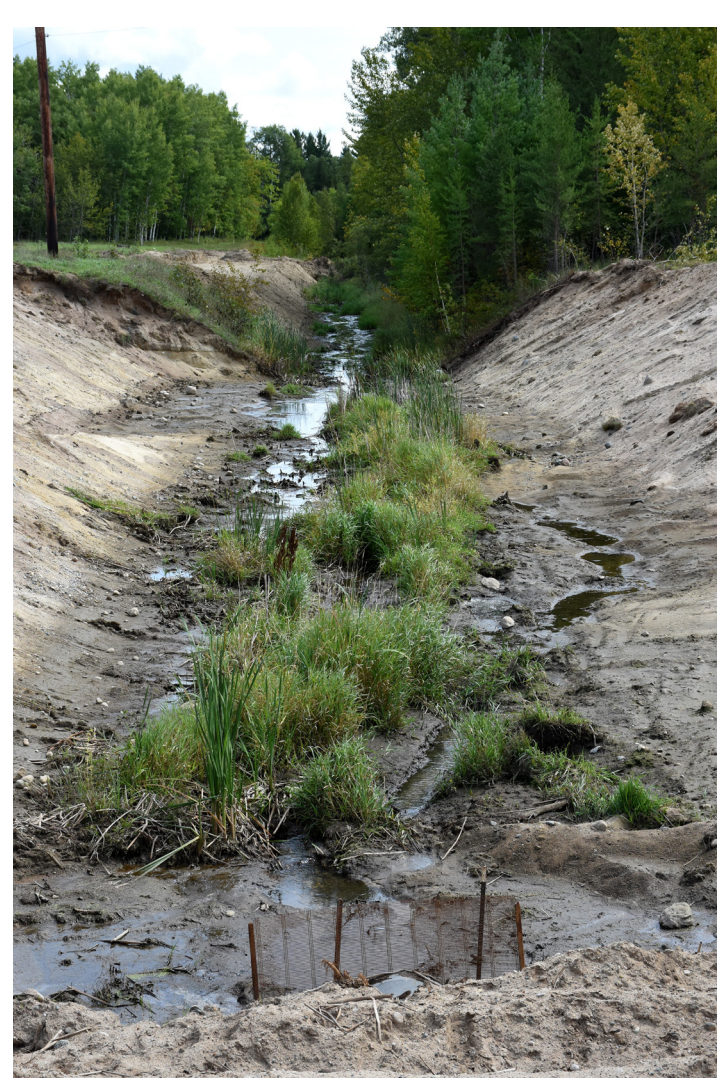
The Lake Irving ditch is being re-meandered to look and function more like a stream. It's part of the Beltrami SWCD's Clean Water Fund-backed stormwater treatment project, which is designed to benefit nutrient-impaired Lake Irving and estimated to keep 233 pounds of phosphorus out of the lake each year.

Street sweeping and existing stormwater ponds weren't