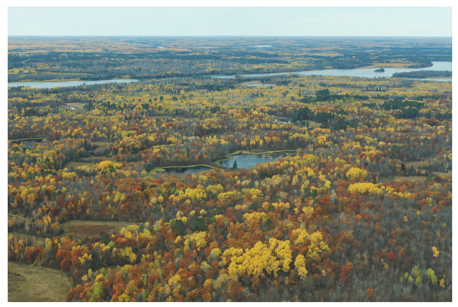
The Mississippi River headwaters region includes ample privately owned forestland. Approximately 7 million acres of forestland in Minnesota is privately owned.

private consultant foresters. WSPs allow approved plan writers to identify private landowner goals for their property and write a plan that encourages sustainable forest management. The plans aim to improve forest health, wildlife habitat, and often utilize timber harvests as a management tool to accomplish landowner goals while providing some income to the landowner. Having a WSP can make landowners eligible for programs such as the Sustainable Forest Incentive Act, which offers per-acre