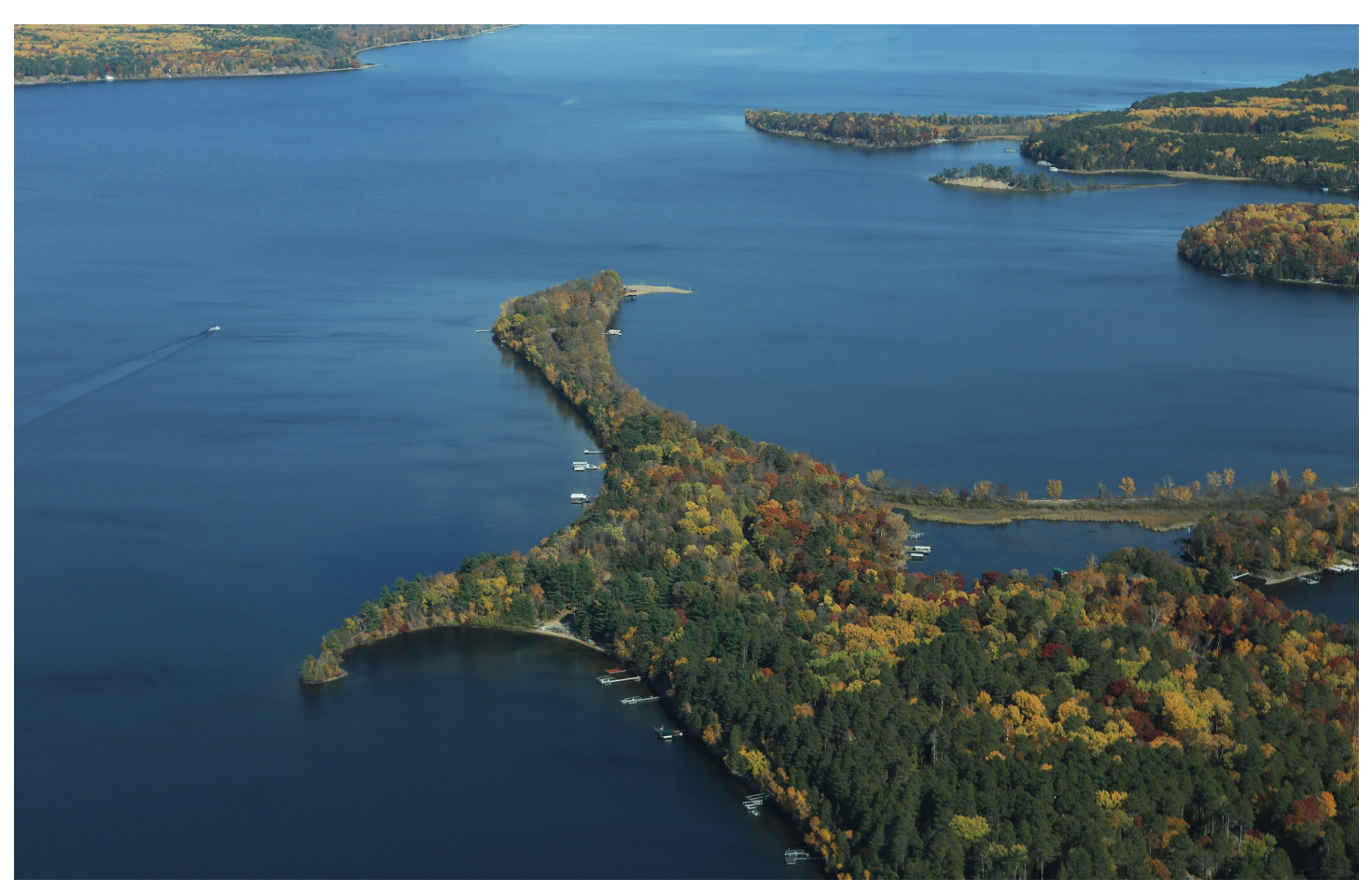
The Whitefish chain of lakes — partially pictured here in October 2020 — is made up of 14 lakes, covering over 10,000 acres with 106 miles of shoreline. The Pine River One Watershed, One Plan prioritizes forestland protection efforts for the watersheds surrounding the Whitefish chain based on input from the watershed's landscape stewardship plan.

U.S. Forest Service recognizes Minnesota partnership as premier partnership in 20-state region for managing private forests for water quality, wildlife, rural prosperity