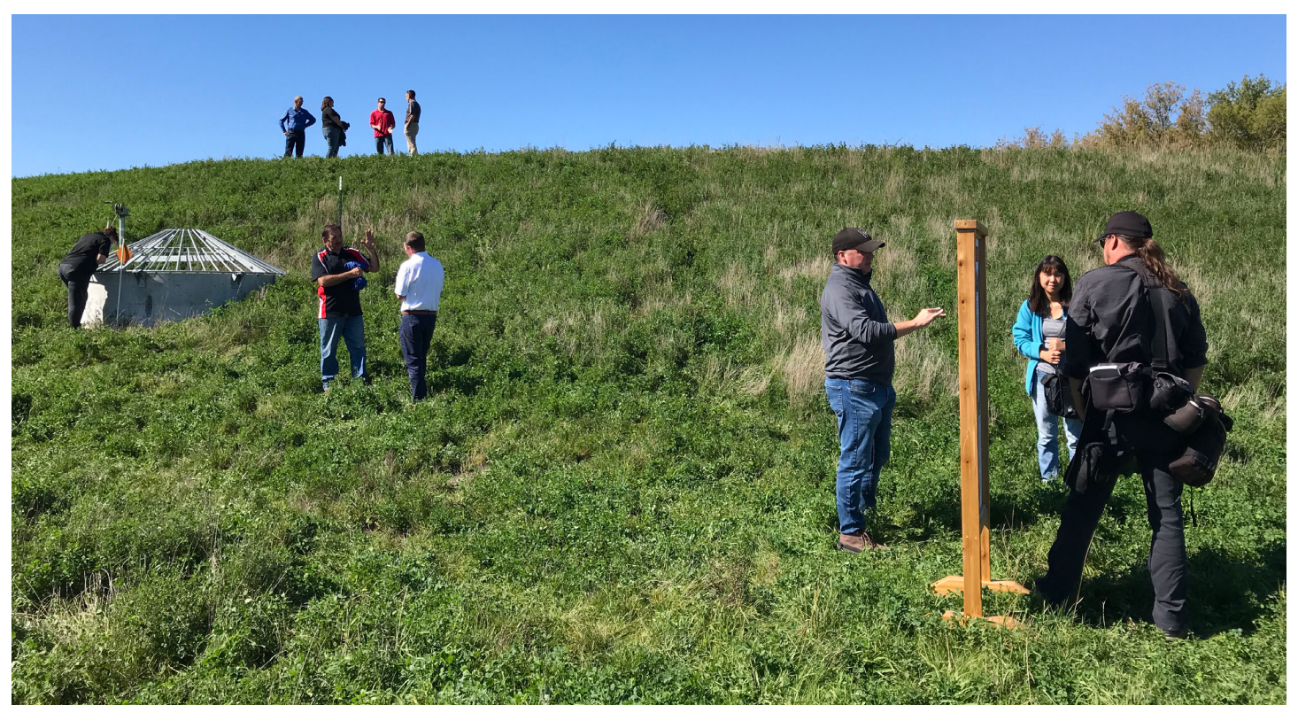
Top: Mower SWCD and BWSR staff visit with a landowner and Austin Daily Herald journalists after the Climate Week event at the dam, which functions along a 2,000-foot-long embankment with an extremely high-flow reduction outlet and a low-flow pipe. By temporarily retaining water after heavy rains, the structure reduces downstream flood damage and improves water quality. This site handles drainage from 1,240 acres. Bottom: The basin outlet is seen from the top of the embankment.