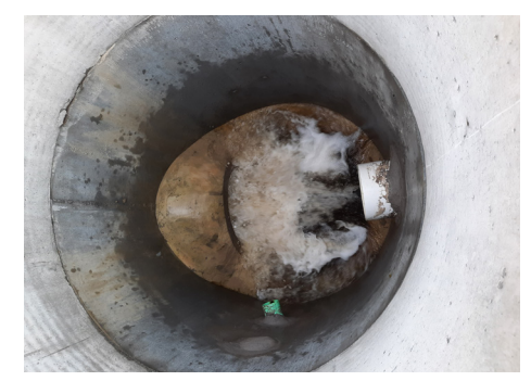
Mower SWCD staff photographed the basin outlet after a late-August rainstorm. Staff notes the project is intended to meter out runoff, allowing sediment to settle out and reducing peak flows that can scour downstream banks. This project will slowly release water over one to three days vs. six to eight hours.

one solution that could play out in more places across Minnesota.