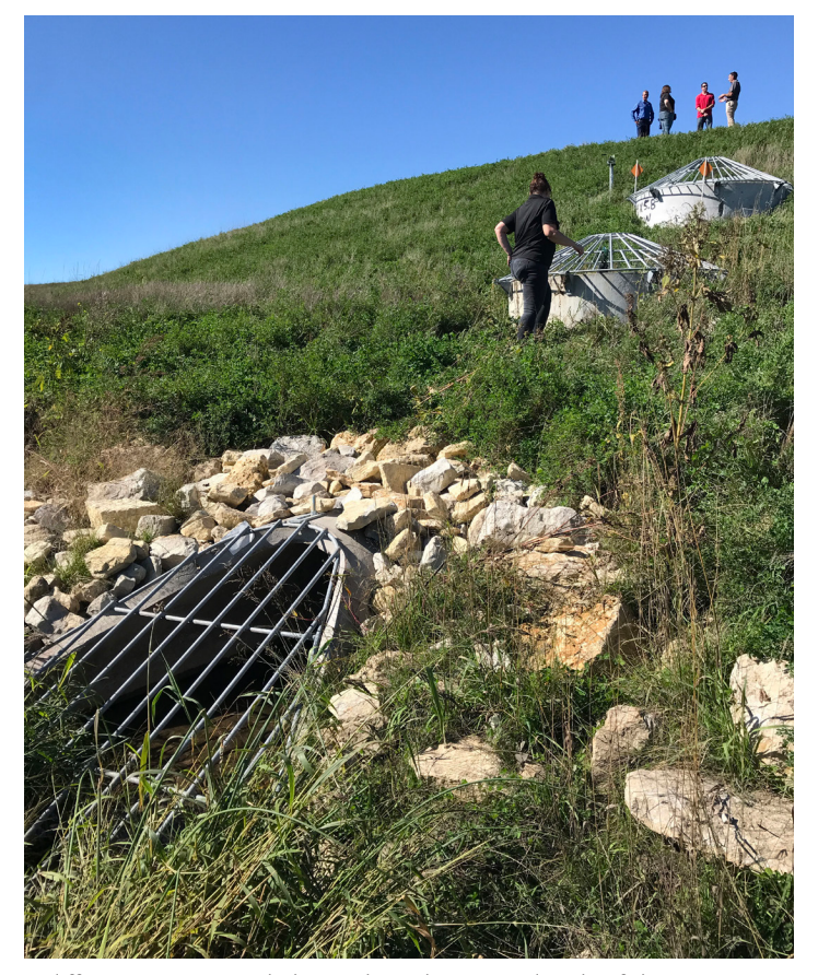
A different perspective helps to show the size and scale of the project.