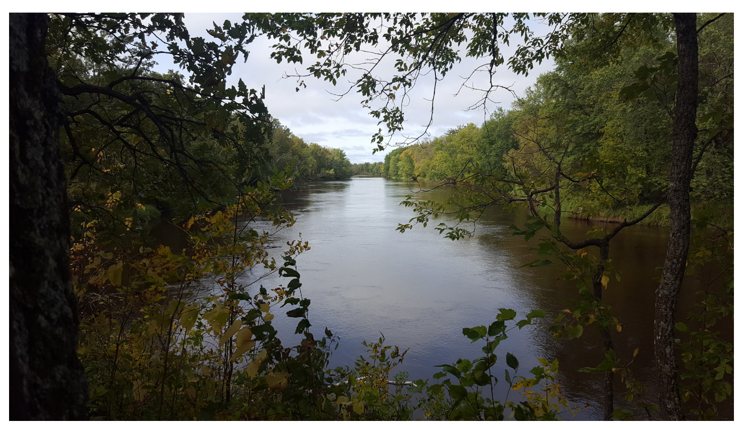
A RIM easement located along the Mississippi River in Aitkin County incorporates native vegetation to enhance habitat and improve water quality.

2021 Clean Water Fund and Outdoor Heritage Fund appropriations from the Legislature that emphasize buffers, wetland restorations and priority watersheds will support new conservation easements statewide