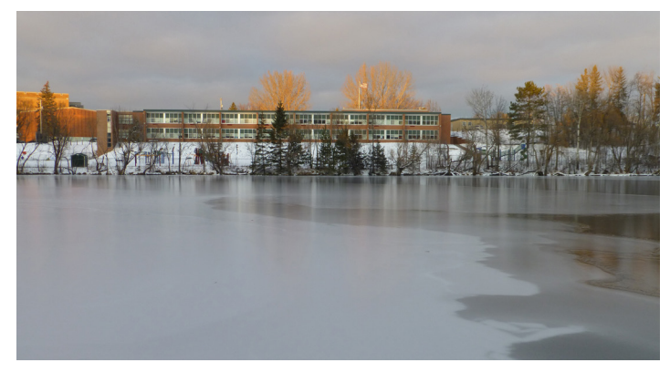
A winter view shows Vandyke Elementary School from Trout Lake, where algae blooms have increased in recent summers.

learning standards, but also illustrated a real-world problem, Hoeft said, "and what people in different careers do to contribute to the solution." Among them: Engineers, scientists and city workers.