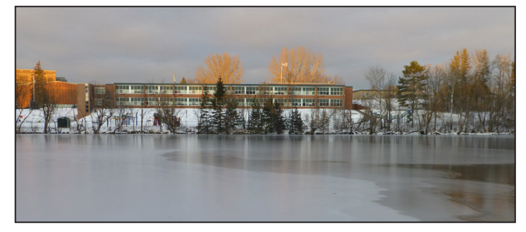
A winter view shows Vandyke Elementary School from Trout Lake, where algae blooms have increased in recent summers.