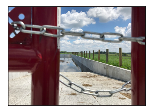
Left: The fencing Ben and Jay Currier installed along the edge of the pit can be raised and lowered. Having two points to scrape manure into the pit gives them an option if buildup occurs during winter freezes. The 1.4 million-gallon design allows for increased volume due to rainfall. Middle: The previous storage area, left of the open barn door, held a week's worth of manure. Right: A ramp makes clean-out easier.

your soil samples and as your crop removes the nutrient value that you've got built up in your soil, you want it to decrease as rapidly as you can so you can get to use the benefit of your manure again. That's the goal," Ben Currier said.