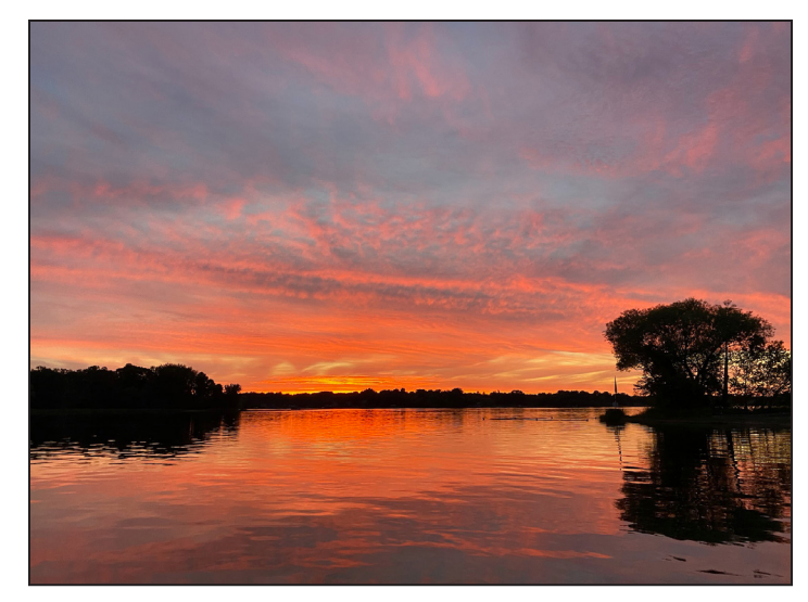
North Center Lake, seen here, and South Center Lake's delisting from the state's impaired waters list is the result of 10-plus years of targeted conservation work. That momentum continues with ongoing work — and dedicated funding.

Runoff from nearly threequarters of the city block