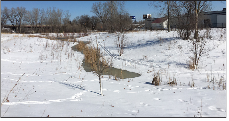
The project, which finished in February 2020, required pumping water from a stormwater sewer interceptor on one side of the railroad tracks under the active rail line to the stream on the other side.

"When water is flowing through a tunnel underground, whatever pollutant is in there — whether it's sediment or phosphorus or