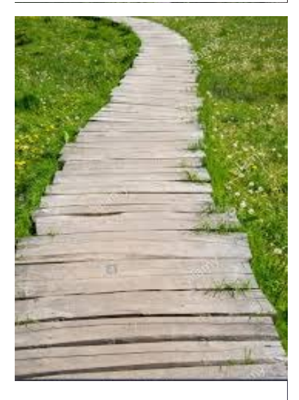
Non-elevated walkway (fill)