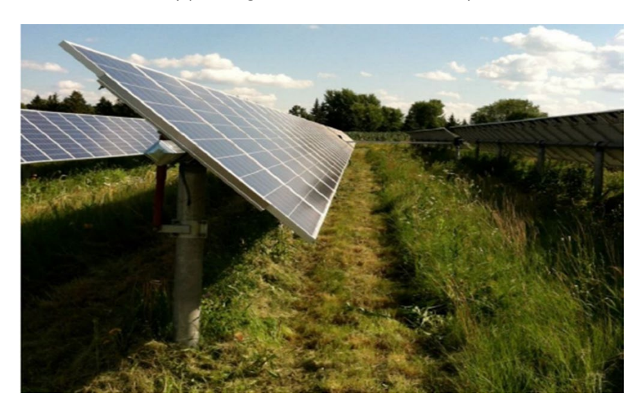
Mowing between solar panels.

Pollinator-friendly plantings under and around solar panels.