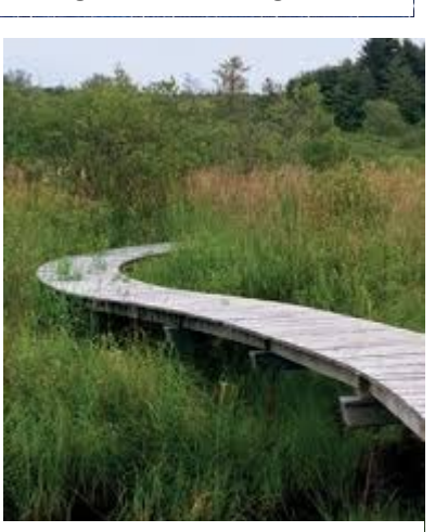
Elevated walkway (not fill)