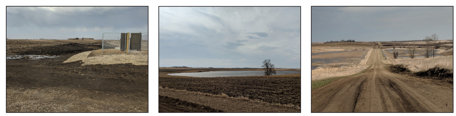
From left: On Stan Gorecki's 60-acre RIM easement, Area II helped to design and install a pump station that lifts water 12 feet from tile that's part of Lincoln County Ditch 37. Water pumped by the lift station from the tile first enters this basin, seen after snowmelt in April 2018. Raising a township road made it possible to increase floodwater storage on Steve Snyder's land to 61 acre-feet.

the 29-mile-long County Ditch 37 system would have shared the $225,000 repair cost. The alternative cost the ditch system about $50,000.