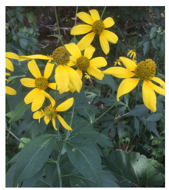
A lanky perennial, green-headed coneflower can grow up to 9 feet tall.

Easy to grow from seed, green-headed coneflowers can spread aggressively by rhizomes in a favorable environment. They prefer moist soils and full to part sun. Seeds of all varieties require cold-and-moist stratification to break dormancy and enable germination. When seed is spread in late fall, stratification can occur naturally over winter. Give these plants enough room; they'll grow up to 9 feet tall with a 2- to 4-foot spread. The species is tolerant of seasonal flooding and wet soils.