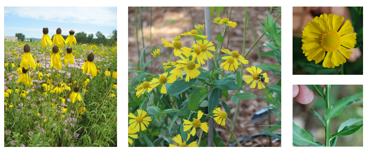
Far left: The lobes of gray-headed coneflowers' leaves are narrower. Three images at right: Sneezeweed has winged stems and notched ray flowers.

dark brown in color. The flowers of sneezeweed ( Helenium autumnale ) are similar in shape to those of green-headed coneflower, but sneezeweed is shorter, with a winged stem, notched ray flowers and unlobed leaves.