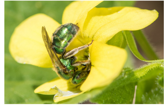
A metallic green sweat bee enters the violet flower upside down to reach nectar at the bottom of the flower, which transfers pollen to the bee.

The three-quarter-inch, showy yellow flowers have five petals with purple or brown vein-like lines. The lower petal will have several lines; the other petals will have few to none. Flowers rise from a stem that extends from a leaf axil. Individual plants produce one to a few showy flowers. The closed flowers ( cleistogamous ) lack petals and look like buds that never open. Both types of flowers produce three-part seed capsules containing many small brownish to pale white seeds, which can be ballistically scattered or spread by ants. This plant has both basal leaves and leaves on the stem. Basal leaves are 1.5 to 3 inches