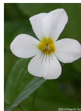
Clockwise from top: Yellow prairie violets are found in remnant prairies. Common violet ; Canadian white violet

The three-quarter-inch, yellow flowers with five petals make this violet easy to distinguish from other Minnesota violets, which are violet or white. Our only other yellow violet in the state is the yellow prairie Violet, Viola nuttallii , which has been found in three western Minnesota counties — Traverse, Lac Qui Parle and Yellow Medicine. When not in bloom, downy yellow violets look similar to common blue violets, Viola sororia , and Canadian white violets, Viola canadensis , which can be found in the same areas.