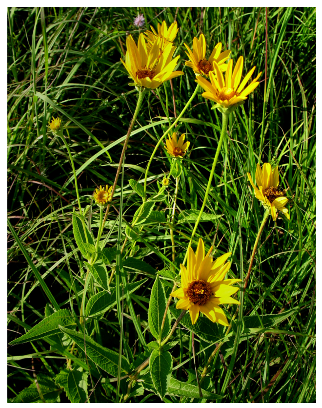
Ray flowers are fertile; they produce seeds.