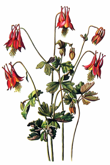
Columbine Aquilegia spp.