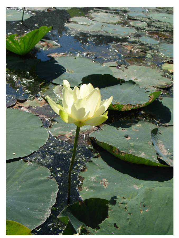
Figure 1.7 White water lily

regulatory programs in Minnesota may specify detailed requirements on what, how, when, and where to monitor a recently completed project. This may differ from the Guide's more generalized monitoring recommendations.