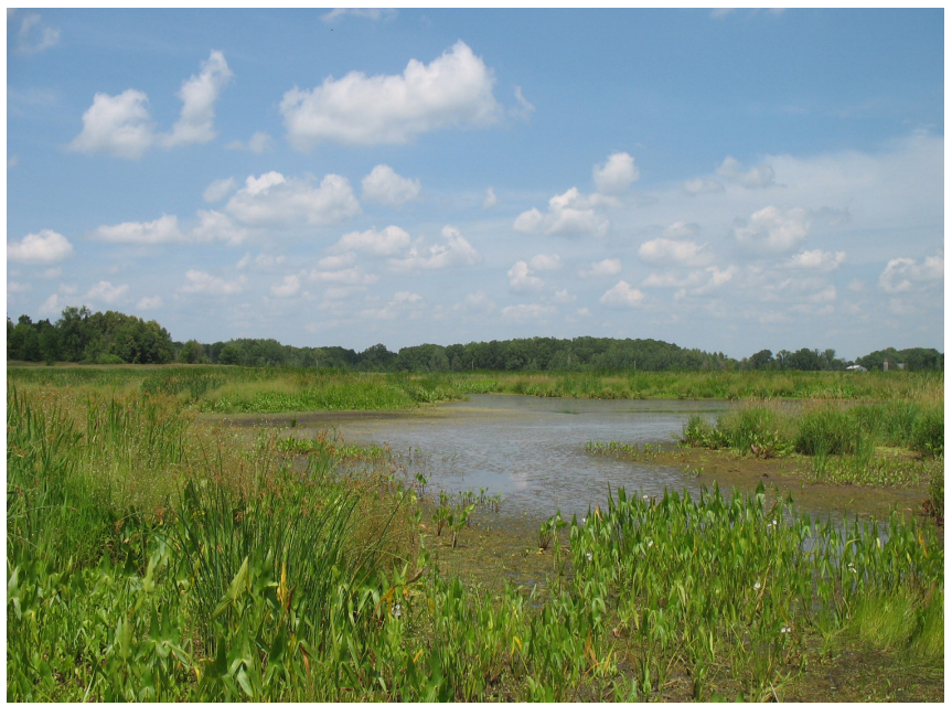
Figure 1.1 Shallow marsh restoration in Chisago County

Information from these documents along with new concepts, strategies, and techniques are incorporated into this updated Minnesota Wetland Restoration Guide. This new Guide brings information from the previous documents together with updated research and the hands-on experience of practitioners from across the state. The result is a comprehensive multidisciplinary document that offers sound engineering and ecological principals for restoring and creating functional and sustainable wetlands in Minnesota.