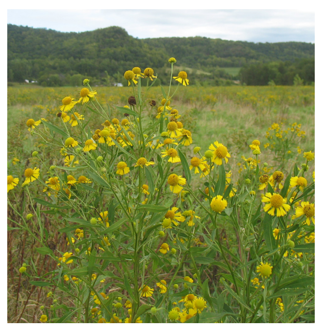
Figure 1.9 Sneezeweed in a restored wet meadow

Assessing and evaluating wetland restoration or creation projects. Discusses the various methods used to investigate, survey, and collect site information and describes how this information fits into the overall project evaluation.