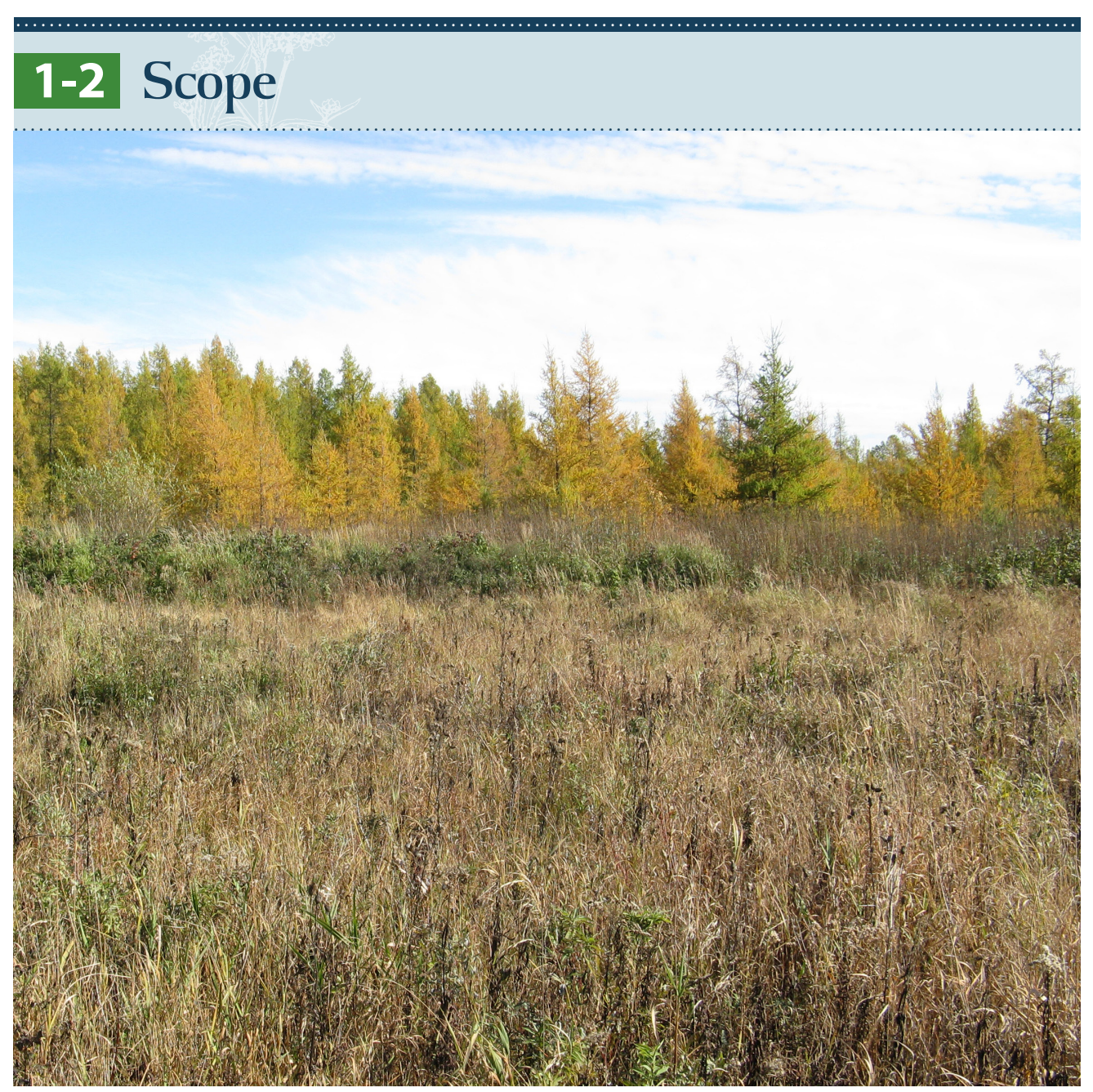
Figure 1.3 Restoration of forested bog

The Minnesota Wetland Restoration Guide is intended to be a comprehensive, technical reference to plan, evaluate, design, implement, maintain and monitor wetland projects. It attempts to provide answers to many common "why" and "how" questions that arise in all phases of a project. The information is applicable to a wide variety of wetland systems found in Minnesota as well as much of the upper Midwest region of the