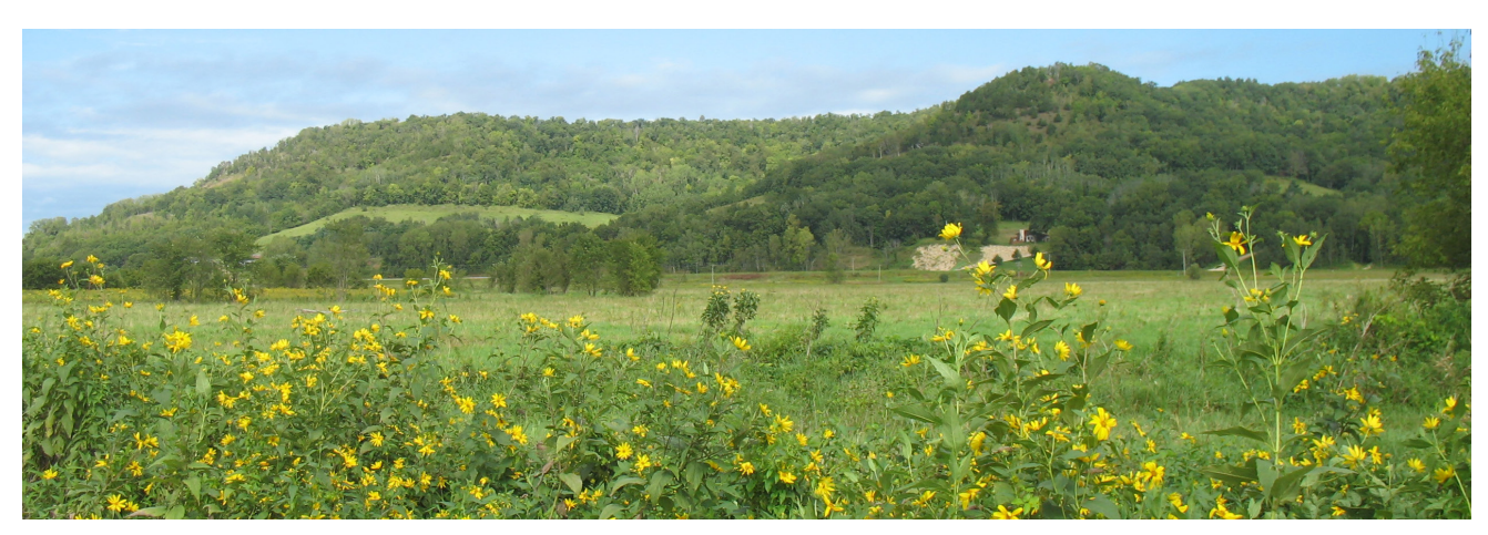
Figure 1.2 Wet meadow restoration in Houston County

Flood control —Wetlands reduce flooding by slowing excess water runoff during times of heavy rainfall.