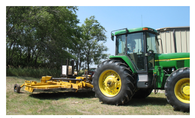
Figure 6.23 Wet blade mower

More detailed information on Mowing can be found in the Mowing Technical Guidance Document located in Appendix 6A-3.