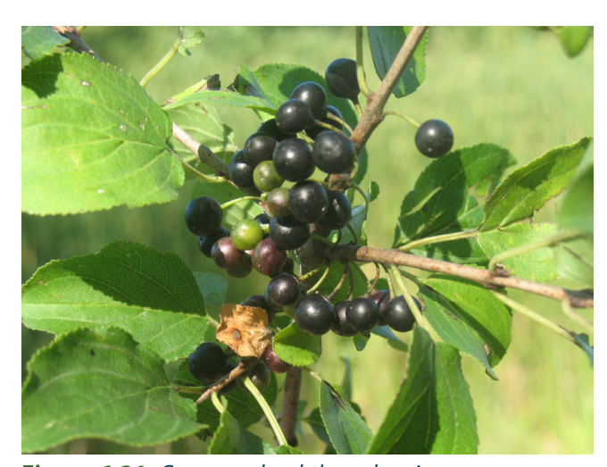
Figure 6.31 Common buckthorn berries

More detailed information on Tree and Shrub Removal can be found in the Tree and Biological Control Technical Guidance Document located in Appendix 6A-12.