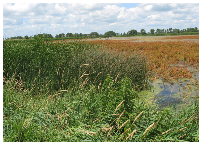
Figure 6.40 Restored shallow marsh

wildlife use is a key component of restoration success, monitoring should coincide with which species and uses are of interest (e.g. waterfowl breeding, nesting, migration stop-over habitat). To minimize disturbance in high quality wetlands with sensitive substrates (fens, seeps, bogs), it is best to sample during the drier part of the growing season.