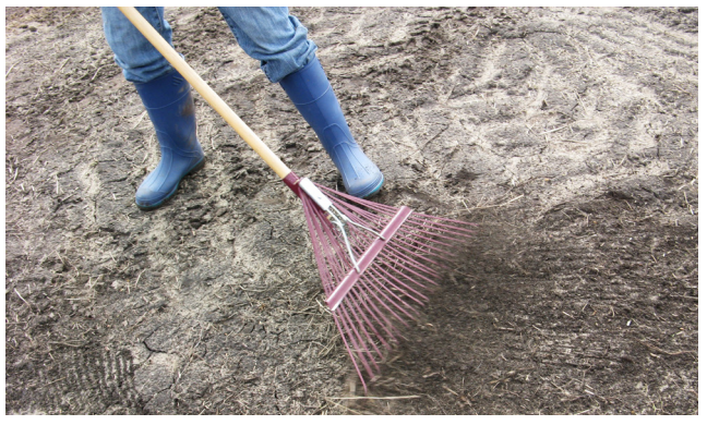
Figure 6.28 Replanting

Supplemental planting can be conducted by hand for small areas or by mechanical means for large areas. As with initial vegetation establishment, proper seed bed preparation and the selection of the appropriate methodology (broadcast, drill) is essential for success. Other maintenance techniques such as mowing and herbicide application are often used in combination with supplemental planting.