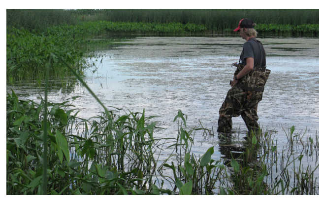
Figure 6.39 Assessment of deep marsh