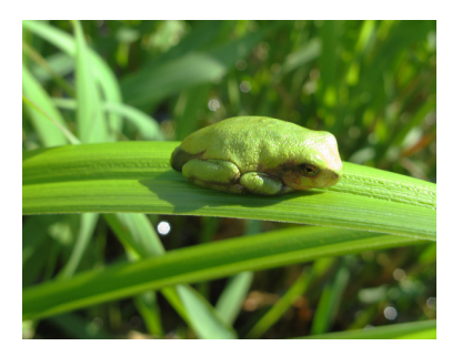
Figure 6.6 Gray tree frog in a restored wetland

Hydrology management can have a big influence on the development of wetland plant communities and meeting project goals and outcomes. Wetlands with naturallyoccurring hydrologic regimes usually