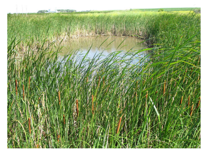
Figure 6.16 Hybrid Cattail Growing in a Deep Marsh

Addition discussion about controlling invasive vegetation and weeds can be found in Section 5, Vegetation Establishment, and in Appendixes 5-A and 6-A.