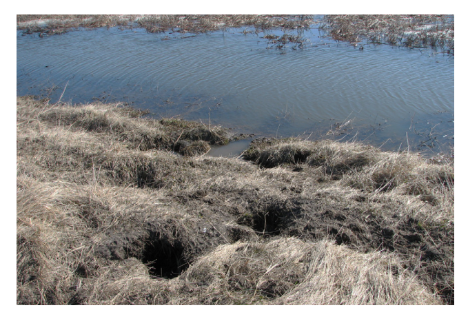
Figure 6.30 Muskrat burrows requiring an embankment repair