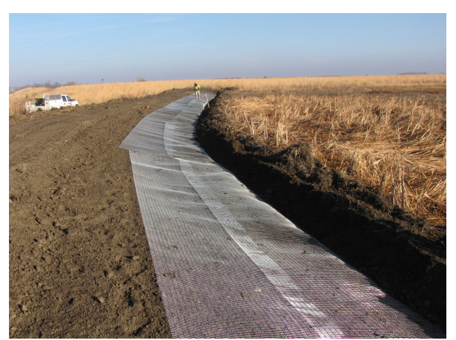
Figure 6.8 Installing fence to prevent muskrat burrows in an embankment

The cost of implementing maintenance strategies must be considered as management plans are prepared to ensure that adequate funding is or will be available for the strategies selected. A project that relies heavily on long-term management to perpetuate project goals can be severely compromised if the required staff resources and costs of management activities are not accounted for or are not available. Budgeting for management activities and associated monitoring is a key component to long-term project success. These activities should be incorporated into the overall project budget right from the start. Project owners or managers may want to consider an "escrow account" or a similar funding plan to ensure adequate financial resources for ongoing management activities. If staff resources or funding are in short supply, then lessactive and lower-cost maintenance strategies should be selected or project goals and expectations may need to be adjusted.