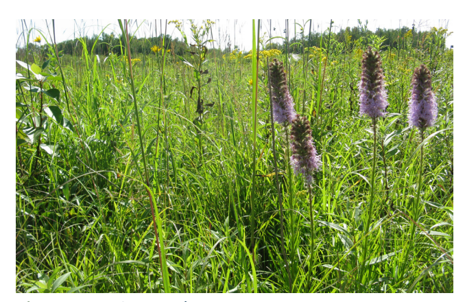
Figure 6.47 Restored mesic prairie

■ The Minnesota Routine Assessment Method (Mn-RAM) is a narrative, question-based assessment of wetland functions. Wetland functions are graded as exceptional, high, medium, or low. While MnRAM was initially developed to support the state Wetland Conservation Act and measure no net loss of functions and values through regulatory actions, it also has been effectively used for local wetland resource inventories and wetland comprehensive plans. An interagency workgroup updates the questions and provides regular software upgrades as well as online do-it-yourself training documentation. An associated management classification tool assists users in customizing the application of functional ratings after