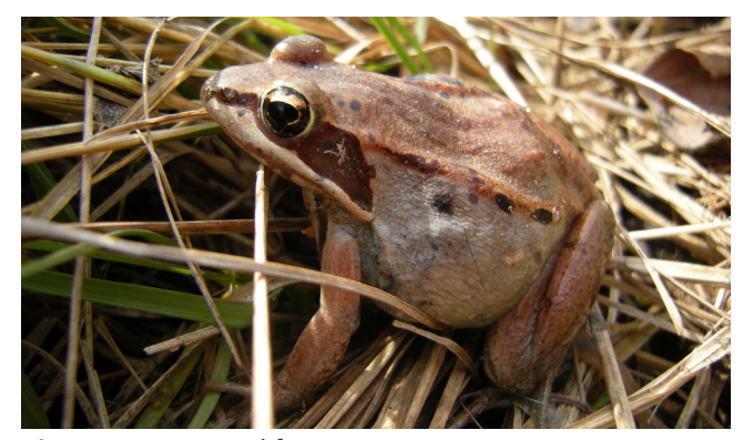
Figure 6.13 Wood frog