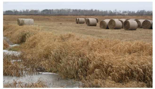
Figure 6.24 Reed canary grass bales