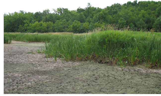
Figure 6.27 Drawdown of a restored marsh

Water level manipulation is used for a variety of management purposes. These include promoting moist soil management and habitat for migratory waterfowl, simulating natural hydrologic cycles, removing or reducing undesired plant and animal species (i.e. hybrid cattail, reed canary grass, carp, buffalo, bullhead, and fathead minnows), providing optimum flood control benefits from a wetland site, or simply to allow optimum working conditions for other maintenance strategies such as embankment repairs or herbicide use. These management techniques are achieved primarily through draw-