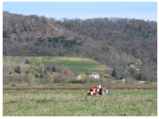
Figure 6.12 Herbicide treatment of reed canary grass

Management plans should clearly convey that management strategies are based on expected project conditions and may need to be adjusted over time to reflect actual project outcomes. If the project is associated with a program that has specific management requirements, the means to officially modify the plan in conformance with program requirements should be identified.