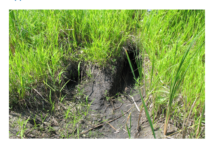
Figure 6.17 Muskrat burrow in an embankment

Additional discussion on these strategies to address problems from muskrats and beaver occurs in Appendix 6A-13.