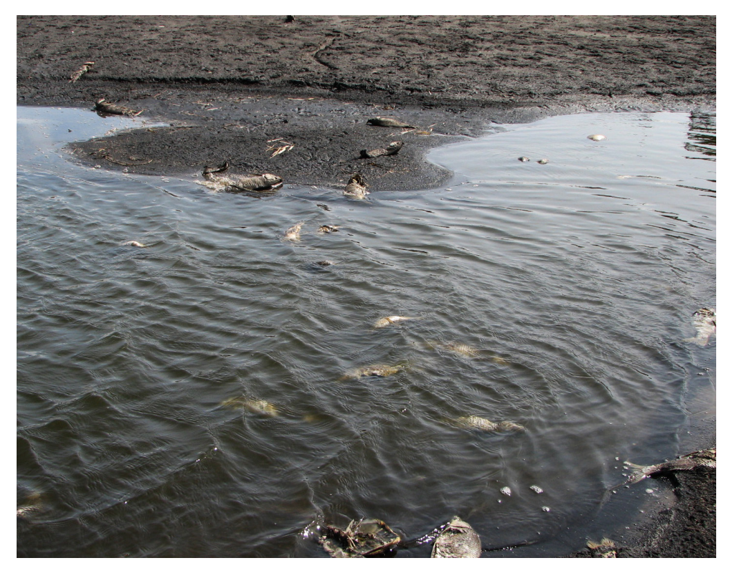
Figure 6.2 Carp removal resulting from a fall drawdown