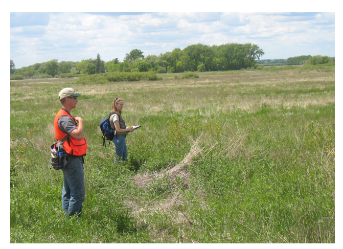
Figure 6.33 Site Inspection