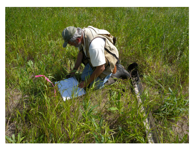
Figure 6.38 Soil profile description

While advanced monitoring does provide better information in terms of project outcomes and accomplishments, it is time-consuming and requires more resources and special expertise. Because of these factors, this level of monitoring is typically limited to projects that are being held to specific performance standards or where there is a need or desire to perform research and measure specific outcomes.