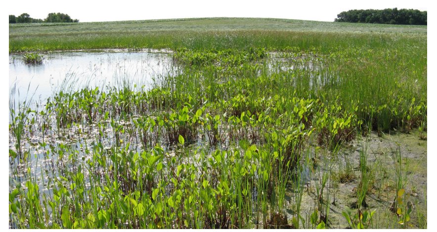
Figure 6.41 Diverse Wetland Restoration

The following are recommended attributes to monitor and include in the advanced monitoring plan: