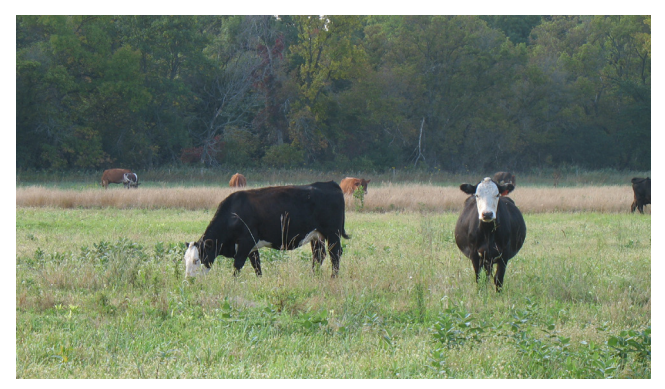
Figure 6.25 Grazing in a wetland restoration