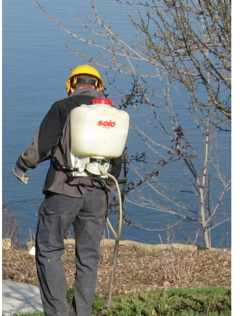
mation on Herbicide Application can be found in the Herbicide Application Technical Guidance Document located in Appendix 6A-1.