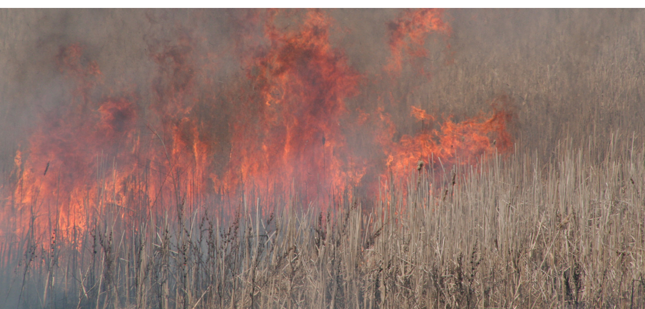
Figure 6.4 Prescribed burning of a wet meadow wetland