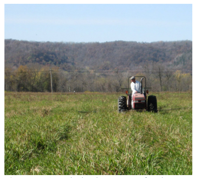
Figure 6.7 Boom herbicide treatment of reed canary grass

Project managers need to consider potential consequences associated with different vegetative and hydrologic maintenance strategies and how they can affect overall site management. Chapter 6-2 discusses some common maintenance strategies, their advantages and disadvantages, and when and how they should be implemented. It is important to note that a strategy that is successful in one instance may not be in another. Therefore, project managers should tap the expertise of other managers and natural resource professionals who have had experience with utilizing one or more of the strategies being considered. Reference to other published resources is also suggested; many exist that are specific to select maintenance strategies and include