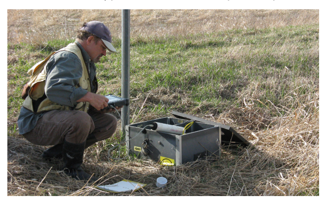
Figure 6.42 Measurement of Water Levels

Hydrology is a key variable in wetland systems, driving the biology and chemistry of wetland soils and the establishment of vegetation. The hydroperiod (duration and frequency of inundation or saturation) is closely linked with the development and maintenance of the various wetland types and thus is an important predic-