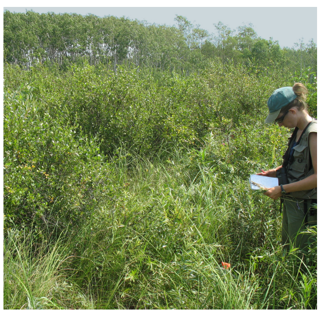
Figure 6.32 Assessment of a shrub wetland

The primary goal of most wetland restoration and creation projects should be to develop wetland ecosystems that function like and resemble natural wetlands and their surrounding upland habitats. How well this occurs over the life of a project often defines a project's success. The ecosystems of all restored and created wetlands experience dramatic changes during the early years of their establishment. Hydrologic regimes and plant communities are establishing, and animals are re-colonizing the site. To measure the success of any wetland restoration or creation project will require several years of assessment through on-site monitoring.