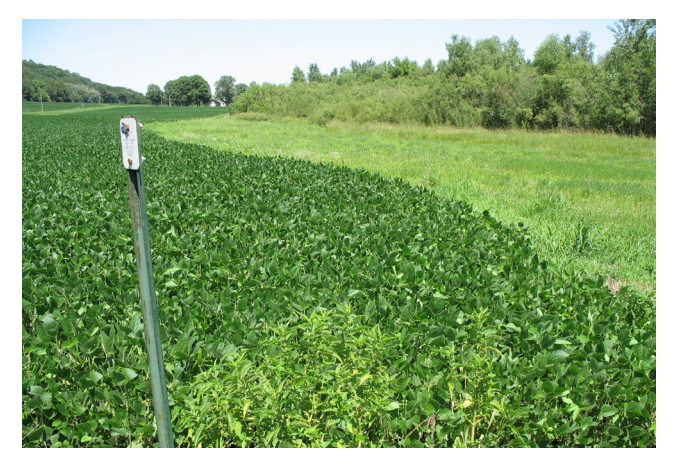
Figure 6.9 Soybeans adjacent to a wetland restoration