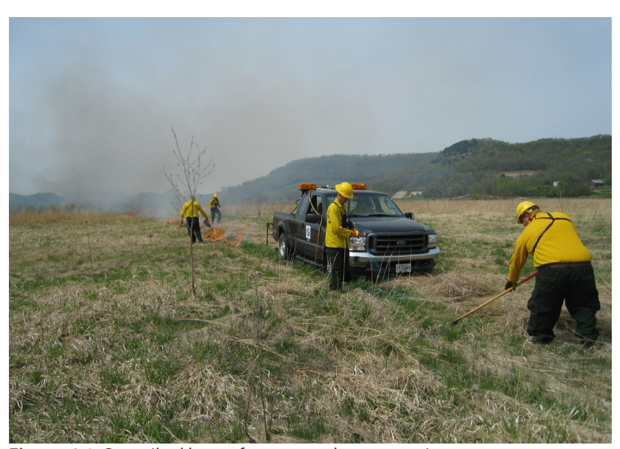
Figure 6.1 Prescribed burn of a wet meadow restoration

Understanding the project goals and outcomes is essential to developing and successfully implementing a management plan. Management plans anticipate project development and provide a means to control aspects of a project after initial construction and establishment. Management plans identify project-specific maintenance strategies (water level manipulation, mowing, burning, etc.) and