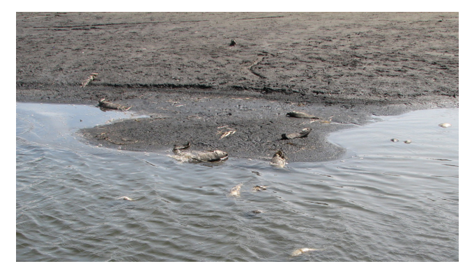
Figure 6.18 Carp control through water level management

Wetlands in Minnesota, whether they are natural, restored, or created, can provide a suitable environment for fish as they inhabit and spawn in these shallow water systems. In some cases, these wetlands provide important spawning areas for game fish. Certain fish species (primarily bottom-feeding carp, buffalo, bullhead, and minnows) however, can pose a significant threat to the health and quality of a wetland. While feeding, some of these fish species will uproot desirable aquatic vegetation and stir up nutrient-laden sediments, which can lead to algal blooms and increased turbidity. This negatively affects the submerged plant community, invertebrate and amphibian populations, macrophytic plant growth, water quality, and ultimately provides poor habitat for most wildlife species including waterfowl.