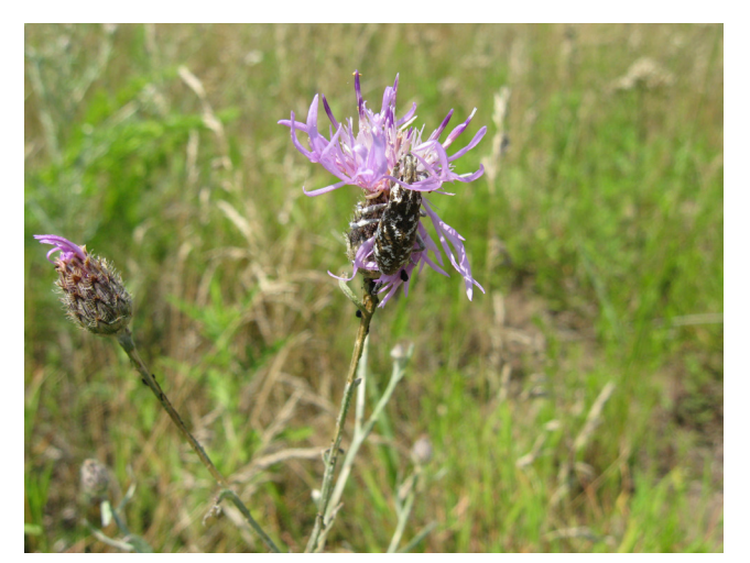
Figure 6.26 Biological control insect on spotted knapweed