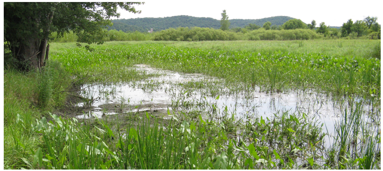
Figure 6.19 Restored wetland associated with a stream in southeast Minnesota