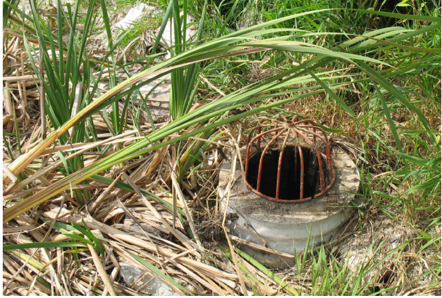
Figure 6.10 Drop inlet structure for wetland outlet

Management plans should consider effects of climate variability and extreme precipitation events or patterns that can influence both short and long-term wetland function. For example, a large rain event or a prolonged drought will likely affect wetland hydrology and could influence specific wetland goals such as providing suitable brood habitat for waterfowl. Factoring in management options for unusual conditions strengthens the management plan by providing clear guidance and direction to respond and adapt appropriately to changing site conditions. The plan could identify specific maintenance strategies to be used during times of excess water or drought in order to meet and maintain specific project goals.