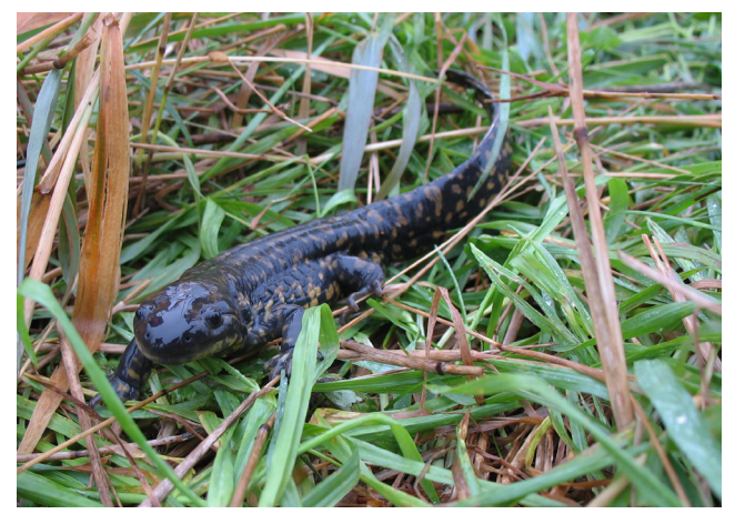
Figure 6.45 Tiger Salamander

for laboratory analyses of soil characteristics such as organic matter content, pH, nitrogen, phosphorus, and other structural or chemical properties.