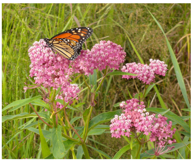
Figure 6.11 Monarch on marsh milkweed

Restoration strategies should be chosen based on their ability to provide desired functions, not because they are commonly used or easily implemented.