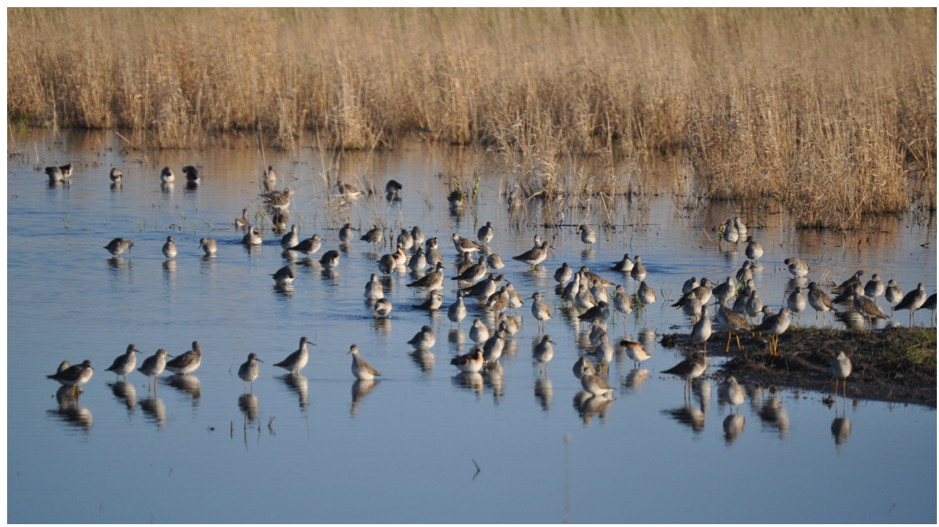
Figure 6.5 Shorebirds foraging in a restored wetland