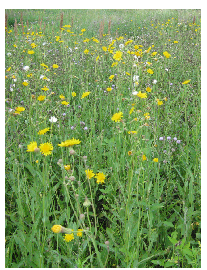
Figure 6.15 Perennial sow thistle in an upland buffer

Undesirable vegetation and weeds in restored or created wetlands and upland buffers can displace native species dominance, hindering goals related to plant and animal diversity. The control of some species is also required under the State's Noxious Weed Law. Invasive species may establish at the same time as native species and continue increasing in abundance, or they may enter a site after soil disturbance or other disturbances that favor weed growth. The rate of spread of invasive