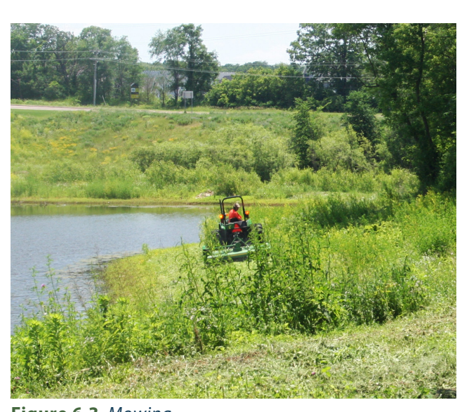
Figure 6.3 Mowing

Wetland restoration and creation projects, particularly during their first few years of establishment, are dynamic and very sensitive to management activities. The effective use of management strategies can dramatically influence site conditions, improve species diversity, and maximize wetland function.