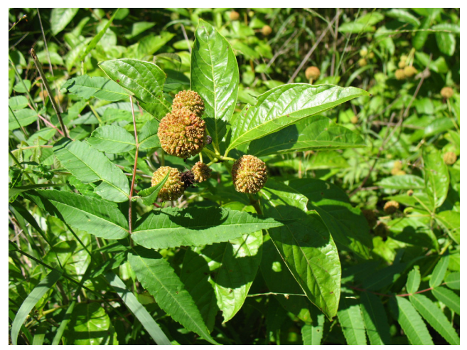
Figure 6.29 Buttonbush, a wetland shrub

More detailed information on Supplemental Planting can be found in the Supplemental Planting Technical Guidance Document located in Appendix 6A-9 .