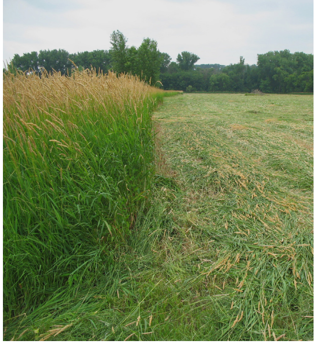
Figure 6.35 Wetland Encroachment