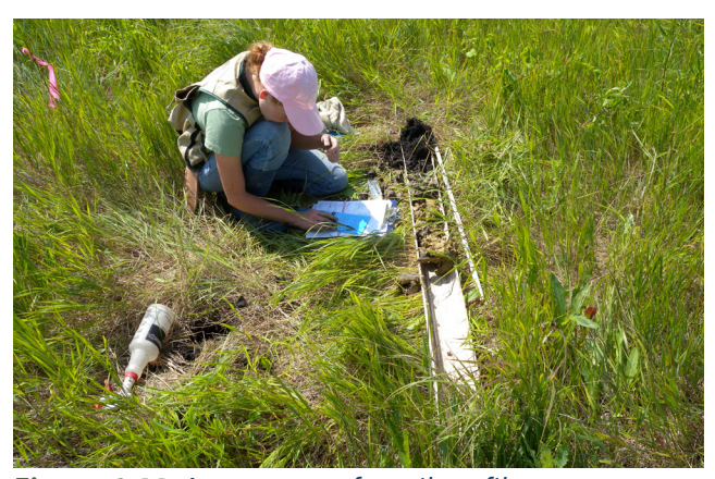
Figure 6.44 Assessment of a soil profile

Soils are the physical foundation influencing the development of biological communities within a wetland. Monitoring over time can identify trends or lack of trends in soil development, such as the accumulation of organic matter. Soil profiles can be reviewed for changes in color, texture, and structure. Because wetland hydrology will drive the development of wetland soils, monitoring efforts tend to focus more on the hydrology aspect of soil formation. Soil samples may be collected