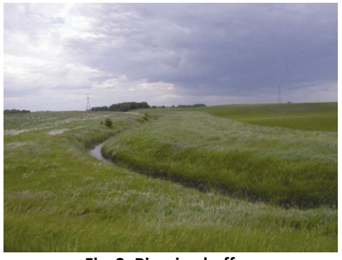
Fig. 3: Riparian buffer