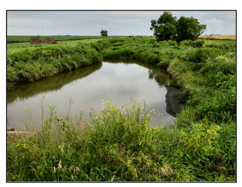
Left: Willow trees frame an upstream, easterly view of Wolverton Creek in Clay County's Holy Cross Township, about an eighth-mile from the Red River. Along this 2.5-mile stretch, grant funds the Clay County Soil & Water Conservation District received in 2007 were used to remeander the stream. Middle: Less than a mile away by road, 130th Avenue South passes over Wolverton Creek in Holy Cross Township. Clay County Ditch No. 36 (not pictured) lies to the east in this upstream view. The creek still cuts a winding path at this point. Right: The outlet of Clay County Ditch 53 is visible off 28th Street South in Holy Cross Township. Wolverton Creek parallels the road for another half-mile before it flows through a culvert.