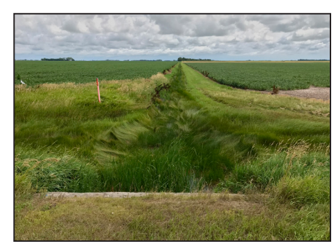
Left: A couple of miles south of the Clay-Wilkin county line in Wolverton Township, narrow buffers are visible in the upstream (east) view of Wolverton Creek. Middle: At a future buffer site, drowned-out crops border the stream channel. Right: Tall grass nearly obscures Wolverton Creek at Wilkin County Rod 3/170th Avenue in Mitchell Township, where the creek cuts a thin line between fields.