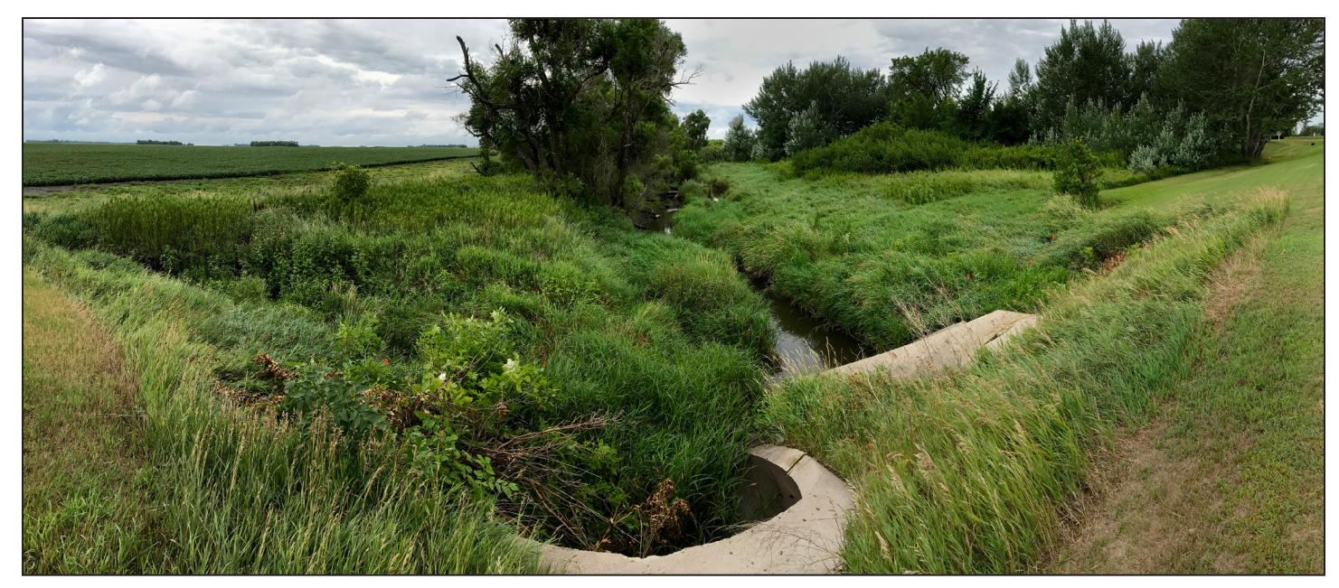
Straight east of Comstock, Wolverton Creek runs under Clay County Road 2 in Holy Cross Township. This is the downstream (north) view.

A third, $2 million phase would augment previous work – adding side-inlet culverts and buffers, clearing downed trees – starting at the outlet where Wolverton Creek cuts to the level of the Red River