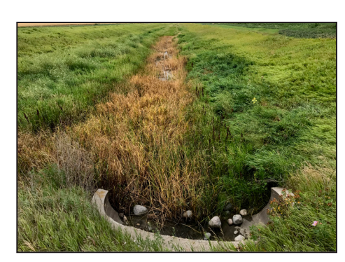
Left: An example of adequate buffering borders Wilkin Creek off of 28th Street South. The Wolverton Creek restoration will add 770 acres of riparian wildlife habitat through buffers, a condition the Minnesota Department of Natural Resources required to work in protected waters. Middle: East of Comstock, Wolverton Creek runs under Clay County Road 2 in Holy Cross Township. Right: Clay-Wilkin Judicial Ditch 1 is one of seven legal ditches that empty into Wolverton Creek, which flows to the Red River. The Wolverton Creek watershed drains 105 square miles within Clay and Wilkin counties.