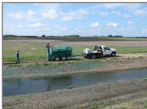
Figure 4. Seeding and Hydro-Mulching a Constructed Ditch Reroute