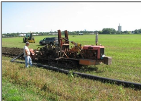
Figure 1. Rerouting Drain Tile Around a Planned Wetland Restoration

The restoration of wetlands in these types of drainage scenarios provides a number of design and construction challenges and may not always