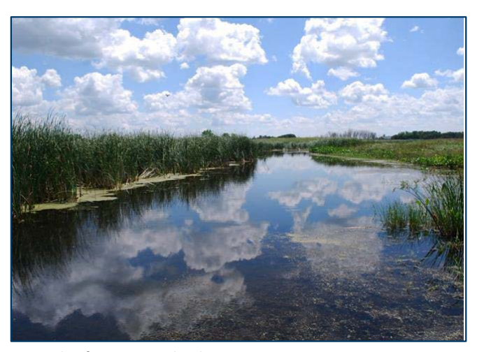
Example of a CREP Wetland Restoration

To date the average size of filter strip buffer application is 6 acres. Over half of the filter strip buffer applications submitted to date use the Eight-Acre Minimum Size Waivers.