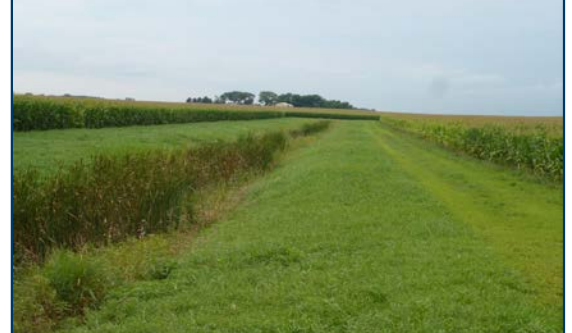
Example of a CREP Filter Strip