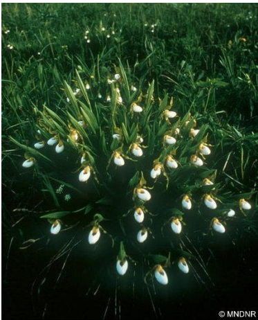
Small white lady's slipper

Calcareous seepage fens are highly susceptible to disturbance. Reduction in the normal supply of groundwater results in oxidation of the surface peat, releasing nutrients and fostering the growth of shrubs and tall, coarse vegetation that displaces the fen plants. Nitrogen-rich surface water runoff into fens promotes the invasion of aggressive exotic plants, especially reed canary grass, that also outcompete the fen plants. Flooding drowns the fen plants. The soft, saturated character of the peat makes almost any level of activity within them, by humans or domestic livestock, highly disruptive.