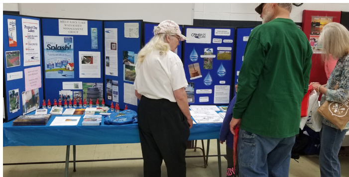
The Compass Program had a booth at the 2019 Rivers and Lakes Fair in Aitkin.