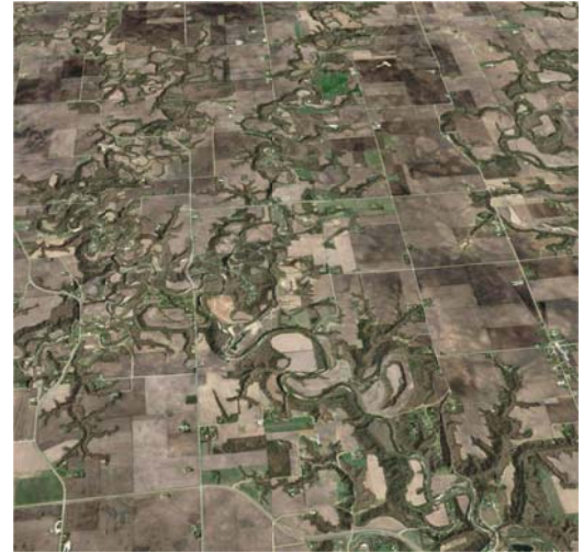
Google Earth image of an incised portion of the Blue Earth Watershed south of Mankato, MN

As large as this natural background sediment supply has been, the rates of soil erosion and sediment supply increased five-fold as the region was developed for row-crop agriculture in the late 19 th Century and into the 20 th Century. Despite extensive improvements in soil conservation over the past 80 years, this high rate of sediment supply continues today. As the amount of sediment from upland soil erosion decreased, the amount of sediment derived from the ravines and steep bluffs along the river channels increased over the last half of the 20 th century. The largest source of sediment shifted from fields to the steep bluffs along the incised river valleys. The cause of this increase in near-channel sediment supply is an increase in river flow. Higher flows produce deeper water and swifter currents, as well as more channel shifting that can direct erosive flows against the channel banks and bluffs. As we evaluated solutions to reduce sediment loading, we considered not only actions to reduce upland soil erosion and stabilize bluffs, but also actions to reduce the peak river flows.