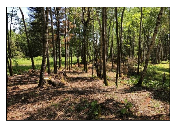
Once dead balsam trees were cleared, Jamie and Penny Juenemann were left with a stand that consists mostly of stunted birch, quaking aspen and bigtoothed aspen. They saved other shrub species, and aim to include a mix that will feed wildlife.

"(An) EQIP grant really gave us something systematic to work with, rather than haphazardly going through the woods," Juenemann said. "When you have trees scattered across the landscape in kind of undefined areas, you kind of lose track of them. Here, it's a defined area. ... I think it's going to be easy to maintain and manage long-term." As he walked, Jamie pointed out moss-covered stumps, remnants of white pines 2 to 3 feet in diameter harvested more than 100 years ago. He pointed out mounds and