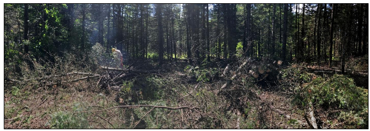
A Conservation Corps Minnesota & Iowa crew cut, cleared and burned balsam decimated by a spruce budworm outbreak July 5 on 5 acres of Terry Gydesen's property outside Two Harbors. With a $114,000 Clean Water Fund grant from the Minnesota Board of Water and Soil Resources, Lake SWCD hired the crew. Below: Gydesen, a Northeast Minneapolis-based documentary photographer, learned spruce budworms were killing her trees shortly after she bought the land at the Knife River headwaters.