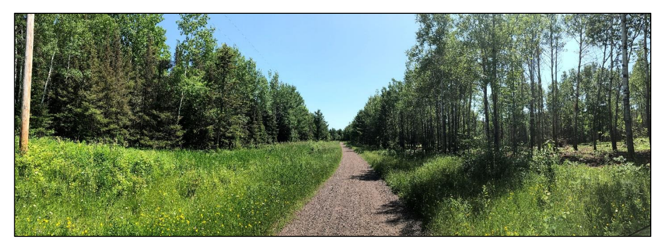
A before-and-after view of forest choked by balsam and spruce trees, left, and one cleared of dead and dying balsam and spruce is visible July 6 off the road where Jamie and Penny Juenemann are part of a Lake SWCD pilot project funded by a Clean Water Fund grant. Below: Penny and Jamie Juenemann's property borders the Little Stewart River, a trout stream where steelhead spawn.