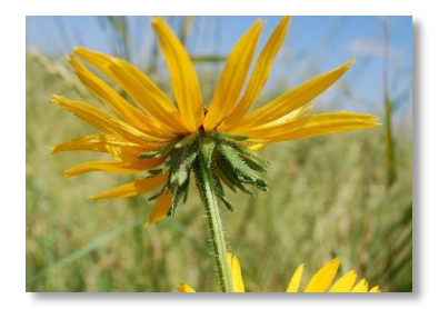
Linear bracts with dense hairs

Being an adaptable species, Black-eyed Susan is found across Minnesota and in 46 of the 48 lower states, as well as most of Canada. It is found in dry and mesic prairies, roadsides, railroads, pastures and in some dry woodlands. It can also colonize a wide variety of disturbed areas.