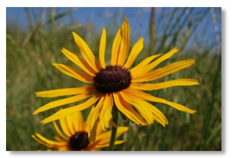
A composite flower head with yellow ray flowers and brownish disk flowers

Name: Black-eyed Susan (Rudbeckia hirta)