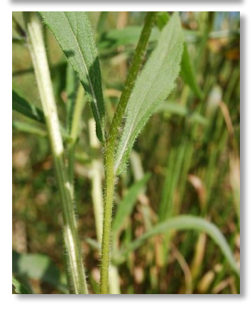
Linear shaped basal leaves