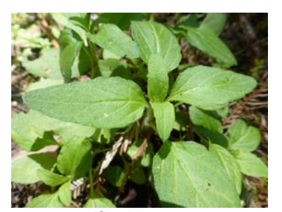
Common Selfheal leaves

Leaves of Common Selfheal (Prunella vulgaris ssp. vulgaris) are twice as long as wide, compared to the lance shaped leaves of Lance Selfheal.