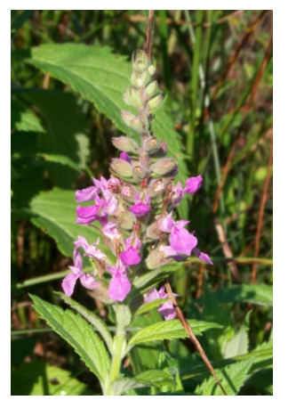
Wild Germander

Wild Germander (Teucrium canadense) is also a member of the mint (Lamiaceae) family with irregular flowers along a spike-like raceme and opposite lanceshaped leaves. The flowers are \( \frac{3}{2} \)-inch long, pink to lavender or white. The plant is typically taller, 1 to 4 feet. It is a native facultative wetland species in Minnesota, found in most of the southern two-thirds of the state.