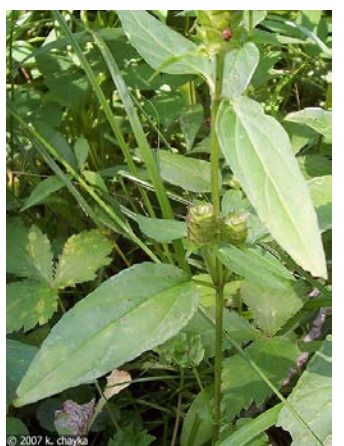
Lance shaped leaves

U.S. There is debate about which varieties or subspecies are native to Minnesota. According to the University of Minnesota Herbarium, Lance Selfheal ( Prunella vulgaris ssp. lanceolate ) is native to Minnesota and Common Selfheal, ( Prunella vulgaris ssp. vulgaris ) is found in Minnesota, but introduced from Europe. Lance Selfheal ( Prunella vulgaris ssp. Lanceolate ), is found in most counties in Minnesota, mostly in the eastern half and northwest edge of the state. Common Selfheal ( Prunella vulgaris ssp. vulgaris ), is not as common, but found in the same range.