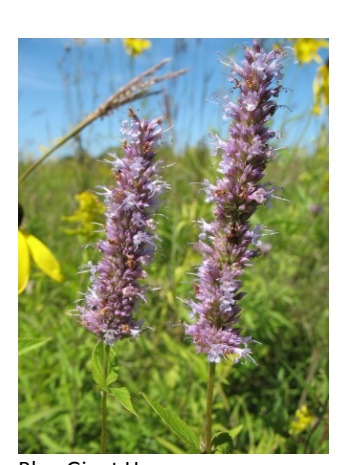
Blue Giant Hyssop