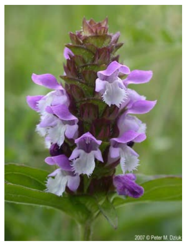
Selfheal flower

Statewide Wetland Indicator Status: • FAC