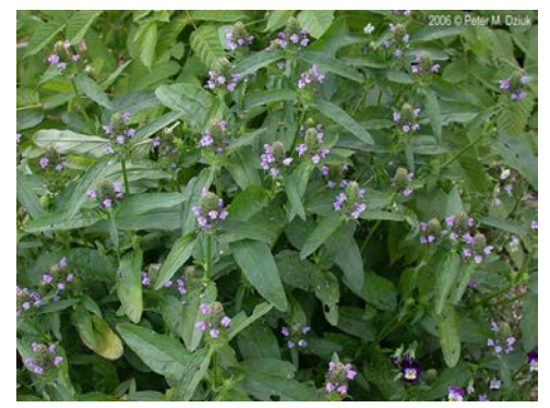
Community of plants