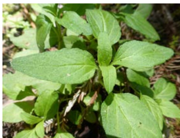
Common Selfheal leaves

Leaves of Common Selfheal ( Prunella vulgaris ssp. vulgaris ) are twice as long as wide, compared to the lance shaped leaves of Lance Selfheal.