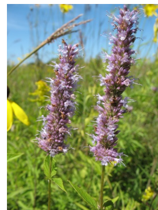
Blue Giant Hyssop

Blue Giant Hyssop ( Agastache foeniculum ), another native mint family member, and shares the same square stem and spike of clustered flowers, which are blue to violet. The flowers are distinguished by their 4