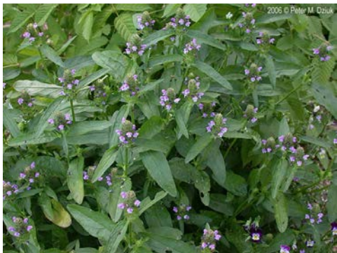
Community of plants