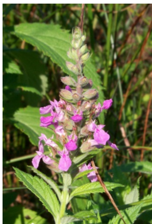
Wild Germander Image Dan Shaw

Wild Germander ( Teucrium canadense ) is also a member of the mint (Lamiaceae) family with irregular flowers along a spike-like raceme and opposite lance-shaped leaves. The flowers are \frac{3}{4} -inch long, pink to lavender or white. The plant is typically taller, 1 to 4 feet. It is a native facultative wetland species in Minnesota, found in most of the southern two-thirds of the state.