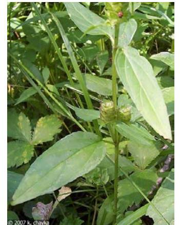
Lance shaped leaves

Flowers bloom along a one to two inch long, thick spike. One plant may have multiple spikes. Each flower is irregular and divided into an upper and lower lip. The upper lip is light to dark lavender while the lower lip is fringed and white to lavender. Like other mint species, the stem is square, sometimes hairy, and typically branches.