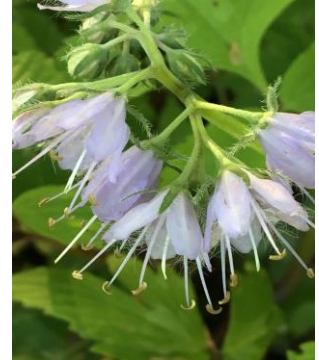
Clusters of tubular flowers

With attractive flowers and unique leaf patterns, Virginia Waterleaf is a stunning component of the woodland understory. This early blooming species grows 12-20" tall in partial to dense shade in moist woods and floodplain forests. Its elegant flowers provide important early season sources of pollen and nectar for pollinators. The plant's ability to tolerate disturbance, establish quickly and thrive along within a diversity of other woodland flowers makes it well suited for restoring woodland understory cover.