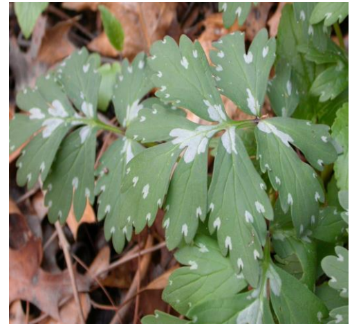
Leaf with light spots.

Pale violet, pinkish or white flowers are born in loose clusters from May to June. The tubular flowers are about 1/2 inch long, and have long stamens. Leaves are deeply divided into 3, 5 or 7 lobes with coarse teeth. Mature leaves are six inches long and four inches wide and may be slightly hairy. The leaves commonly have a water stained appearance that can fade with age. The main stem is purplish where the leaves attach and may have flattened hairs on the stem. Hydrophyllum was formerly placed in the Hydrophyllaceae (Waterleaf) family but is now considered part of the Boraginaceae (Borage) family.