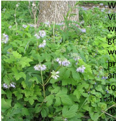
Virginia Waterleaf growing in rich woods

With attractive flowers and unique leaf patterns, Virginia Waterleaf is a stunning component of the woodland understory. This early blooming species grows 12-20" tall in partial to dense shade in moist woods and floodplain forests. Its elegant flowers provide important early season sources of pollen and nectar for pollinators. The plant's ability to tolerate disturbance, establish quickly and thrive along within a diversity of other woodland flowers makes it well suited for restoring woodland understory cover.