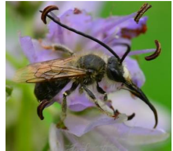
Andrena bee on waterleaf

At least two specialist pollinators use Virginia waterleaf, the waterleaf cuckoo bee ( Nomanda hydrophylli ) and Andrena bees ( Andrena geranii ). Flower nectar and pollen attract many other types of bees including bumblebees, long-horned bees ( Synhalonia spp. ), mason bees ( Osmia spp. ), Halictid bees ( Lasioglossum spp. , Augochlorella spp. , etc.), Andrenid bees ( Andrena spp. ), and bee flies (Bombyliidae). The foliage is occasionally browsed by White-tailed deer, but does not seem to be a preferred food. The species can be used to establish cover on bare areas, such as woodland openings after buckthorn removal. It may not be ideal for some small woodland gardens due to its ability to spread.