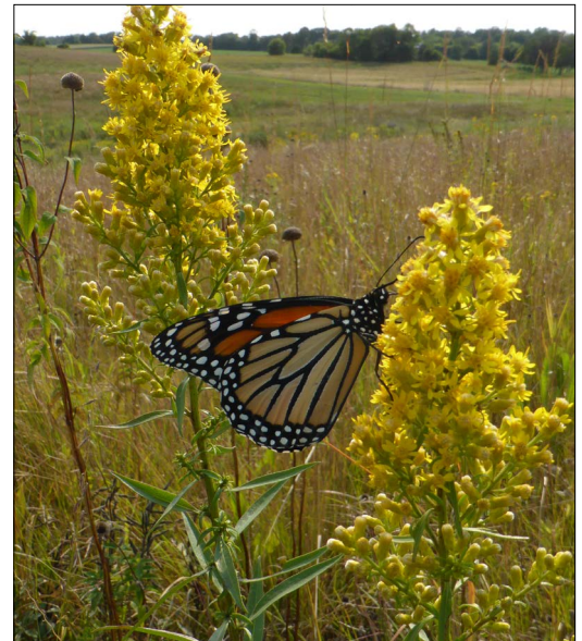
A variety of strategies can help protect plantings from pesticides, including spatial buffers, changes in cropping systems, and reductions in pesticide use.