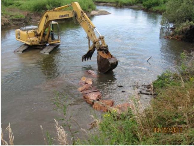
Streambank Stabilization in Progress