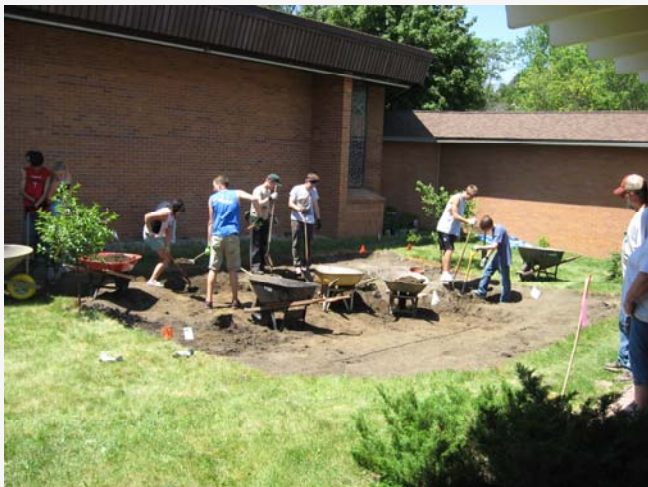
Rain Garden Installation