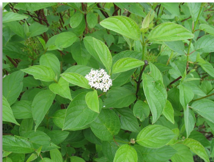
Red-osier dogwood (Cornus sericea) grows in similar locations as buttonbush but has alternate leaves, flat clustered flowers and reddish stems.