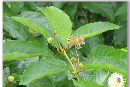
Glossy green leaves that have smooth edges

The species can have a variable growth form depending on growing conditions. In moist soils and full sun it tends to have multiple stems, while in drier soils or shade it may have one or just a few stems. The bark is smooth on young stems but rough and reddish brown on older stems. Its leaves are opposite or are found in groupings of three. The leaves are oval in shape but narrow near the base. They lack teeth and have a glossy dark green surface, with a duller, light green underside. The flowers are arranged in spherical shaped seed heads. Individual flowers are tubular, white, have long styles, and are four-parted.