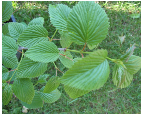
Viburnums such as Arrowwood Viburnum (Viburnum dentatum) have opposite leaves like buttonbush but have teeth on the edges of leaves and flat clusters of white flowers.