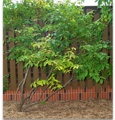
Buttonbush planted in an urban landscape