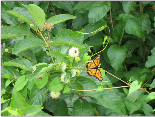
Buttonbush is common in partial shade conditions in floodplain forests

Round clusters of one-inch wide flowers with a "starburst" appearance make Buttonbush unique amongst Minnesota shrubs. Most often found in floodplains and other moist habitats with partial shade, the species is useful for storm water projects, shorelines, and buffers in full sun or partial shade. Its height is variable depending on soil and moisture conditions but it can reach up to ten feet tall. It provides excellent pollinator habitat in mid-summer and its seeds are an excellent food source for birds during fall migration.