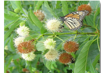
Round clusters of flowers are attractive to Monarch butterflies in mid-summer

Round clusters of one-inch wide flowers with a "starburst" appearance make Buttonbush unique amongst Minnesota shrubs. Most often found in floodplains and other moist habitats with partial shade, the species is useful for storm water projects, shorelines, and buffers in full sun or partial shade. Its height is variable depending on soil and moisture conditions but it can reach up to ten feet tall. It provides excellent pollinator habitat in mid-summer and its seeds are an excellent food source for birds during fall migration.