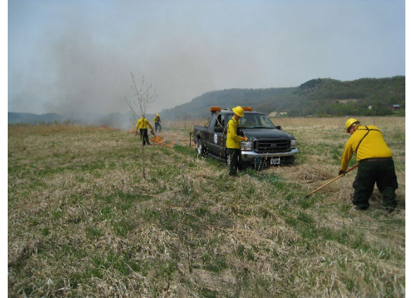
Early spring prescribed burn