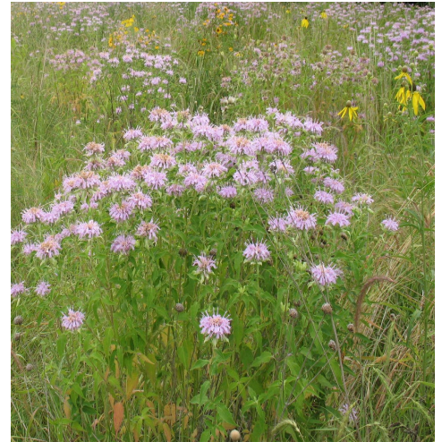
Wild bergamot in a conservation planting

Vegetation Establishment – Thorough weed control is essential prior to establishing pollinator habitat. In many cases, projects are seeded into fields that were previously in soybeans or corn, as agricultural production can help ensure that weeds are sufficiently controlled. However, these areas may have agricultural chemicals in the soil. It is important that pesticides (such as neonicotinoids) that persist in the soil were not used prior to planting, as they can be taken up into plant tissues and affect pollinators. Individual pesticides should be investigated to determine their persistence in the soil. If chemicals have been used it is recommended to crop without chemicals for a year or two or to plant a temporary cover crop for at least a year.