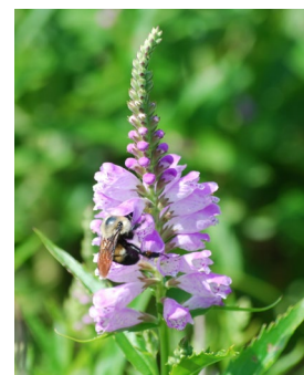
A native bee collecting nectar from obedient plant