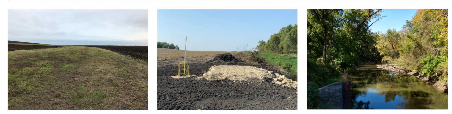
Left: Grassed waterways are a recommended practice identified through the accelerated implementation grant. Middle: Blue Earth County SWCD identified more than 30 potential alternate side inlet sites to reduce sediment entering the Le Sueur River. Right: The Le Sueur River was added to Minnesota's impaired waters list in 2015.

"At this point, we're assessing our shovel-ready projects and possible funding options," Bach said.