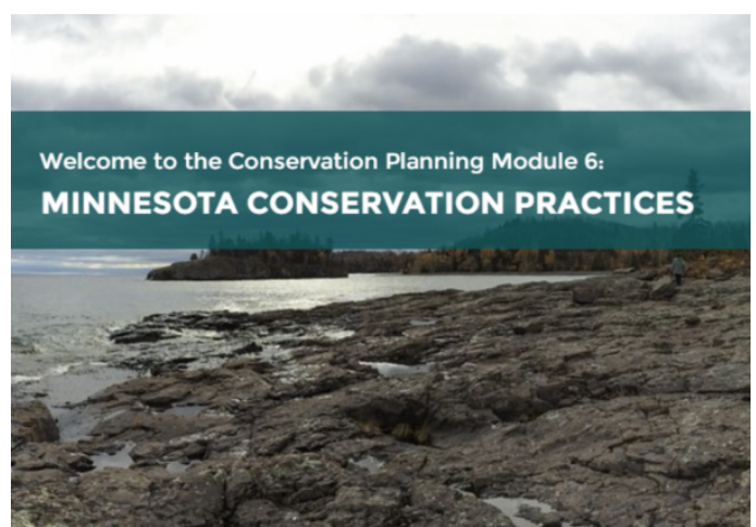
Cover slides depict Core Competency Conservation Training modules. Nineteen modules are offered by the new training series.