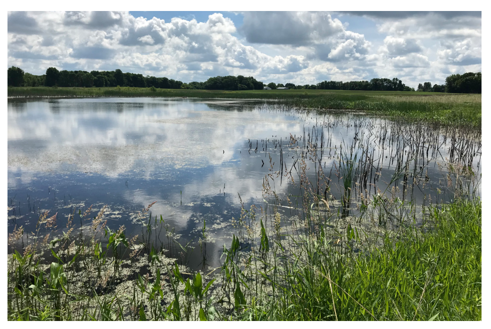
A recently published BWSR study and report compares the quality of restored wetlands — such as the Hennepin County wetland pictured above — with naturally occurring wetlands, such as the Pope County wetland pictured below.

BWSR staff developed the study and report in consultation with the Minnesota Pollution Control Agency (MPCA), the Minnesota Department of Natural Resources (DNR), the U.S. Army Corps of Engineers and the U.S. Environmental Protection Agency (EPA). The primary funding source