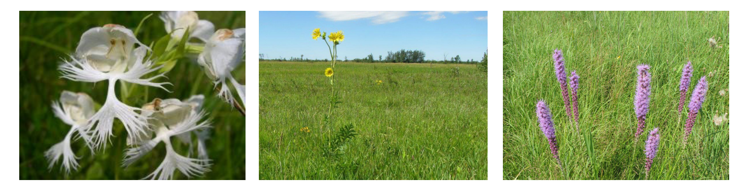
A sampling of species found in native remnant prairie includes, from left: Western prairie fringed orchid, Compass plant, and blazingstar.

Program details and application materials are available here. For more information, contact John Voz at 218-846-8426 or john.voz@state.mn.us.