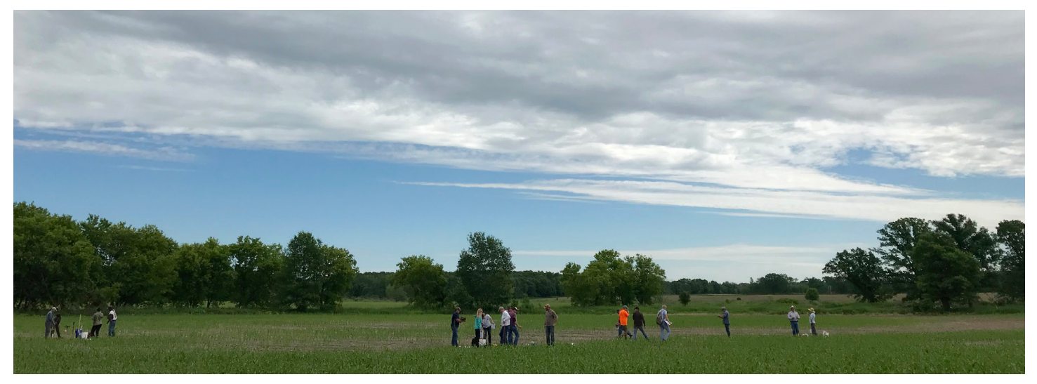
Three stations in a Kanabec County corn field allowed the Minnesota NRCS Soil Health Assessment Training to focus on physical, chemical and biological properties of soil under no-till conditions for the past nine years (bottom left). In an adjacent field (bottom right), they compared those properties in a field where conventional tillage was used.