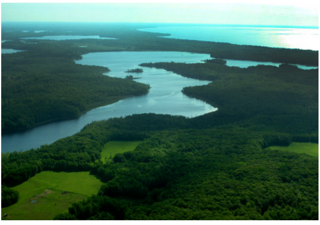
Borden Lake, in the foreground, is one of 25 prioritized lakes in Crow Wing and Aitkin SWCDs' Environment and Natural Resources Trust Fund-supported project to protect water quality by keeping those lakes' watersheds in at least 75 percent forest cover. Mille Lacs Lake is visible in the background.

"Over time, we tend to open up these forested watersheds more and