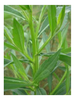
Unique winged stem of sneezeweed

Sneezeweed is widespread across Minnesota and is also found in each of the lower 48 states and most of Canada. Its wide distribution is partly due to the plants ability to grow in a wide range of natural and disturbed riparian and wetland plant communities. Sneezeweed can grow in wet prairies, wet meadows, streambanks, fens, marsh edges, pastures, pond edges and ditches. It seems to tolerate conditions with flooding or grazing and in some cases it can be a good competitor for reed canary grass. About 40 species of Helenium are found in north and Central America with many species being adapted to more arid conditions.