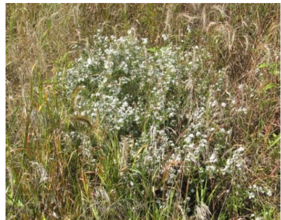
Bushy appearance of frost aster

The species grows in full sun and mesic to dry conditions and can handle a wide range of soil types including sand, loam, clay, and gravel. The plant is most commonly found in disturbed dry prairies, roadsides, field edges, outcrops, pastures, and old fields. It has a relatively limited documented range in