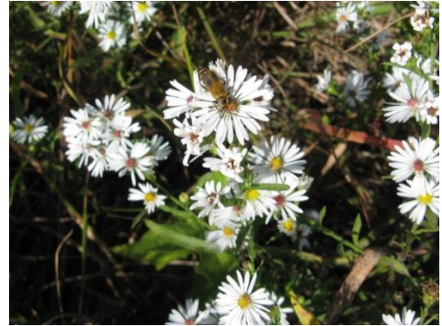
Native beetle gathering nectar from frost aster

Frost aster is one of many Minnesota asters that bloom late in the fall, providing important food sources for pollinators, and adding color to restorations, rain gardens, and lakeshores. Frost aster has a relatively limited range in Minnesota, but its seeds are wind dispersed and can aggressively colonized disturbed areas. As a result, it is likely to expand its range to the north with climate change and other disturbances.