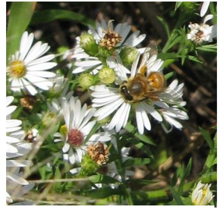
More than twenty ray florets per seedhead