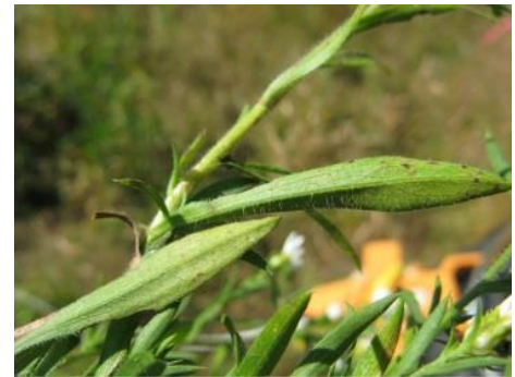
White hairs on leaves

Multiple stems grow from rhizomes to around three feet tall and give the plants a bushy appearance. Densely hairy leaves and stems (often in lines) help distinguish the species from other white asters and give it the common name of "Frost Aster". The leaves are linear or lance shaped and the lower leaves fall off with age. There are many white ray florets (usually over 20) per flower head. Disk flowers (center of flower head) are yellow but turn reddish late in the season. The plant blooms in the fall from September through October. The species looks similar to heath aster ( Symphyotrichum ericoides ) but heath aster has less than twenty ray florets and is pubescent but less hairy on the leaves and stem.